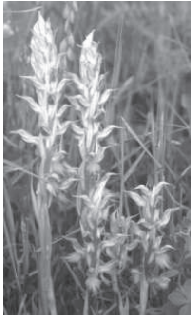
Orchis sancta

For the last afternoon we ventured east once more to the Pirgos area, and stopped on the main road near a honey farm. Here again we found a familiar orchid, Ophrys apifera , and