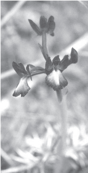
Orchis laxiflora

O. sitiaca and O. sicula with its lovely yellow-edged lip. These orchids were flourishing on some of the driest parts of the hillside, but in the dips where vegetation was a bit lusher and greener Anacamptis pyramidalis was common. We found one hybrid between this species and Orchis coriophora ssp fragrans , known as Anacamptorchis simorreensis , a cross that sits more comfortably in Richard Bateman's classification than in the traditional one.