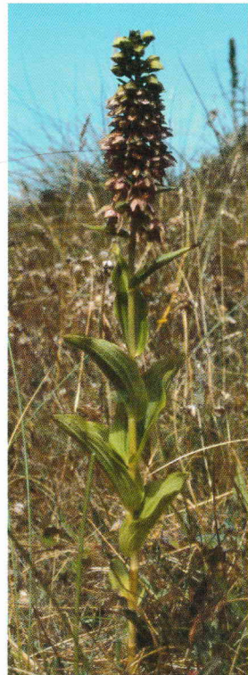
Epipactis helleborine aff neerlandica