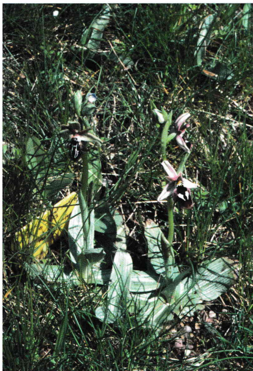
Ophrys cretica & Ophrys reinholdii

The bank itself faces due south and is about 40 feet long and 12 ft down the hypoteneuse. The soil is nothing special, in fact just the opposite: a mixture of reasonable but heavy calcareous loam and two kinds of clay, one grey, sticky, but friable when dry, the other yellow, heavier, claggy, and drying to concrete, and interspersed with stones and boulders of hard carboniferous limestone. Underneath is almost entirely clay and bedrock. I have done virtually nothing to improve the soil but did try to select planting sites according to soil quality. Despite the poor drainage qualities of the soil itself, the slope of about 30 degrees compensates, and the soil dries out quite readily in the summer. This allows the mediterranean species to undergo a dry summer dormancy without problems. Being south facing the bank receives nearly all the sun there is, except in darkest winter, when the sun goes below the level of the greenhouse for part of each day in January (assuming it comes out in the first place!)