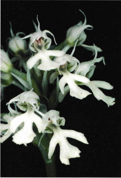
Orchis conica