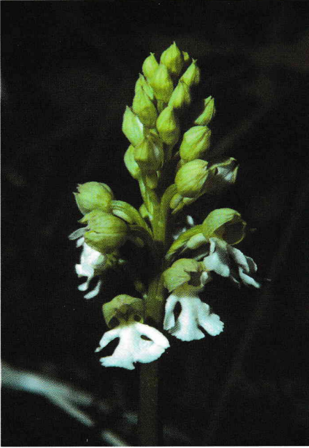
Fig 1: Orchis purpurea - albino, green hood.