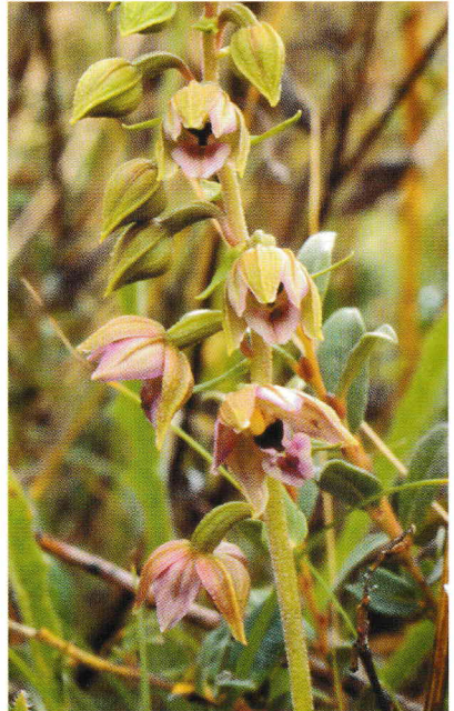
Epipactis helleborine aff neerlandica