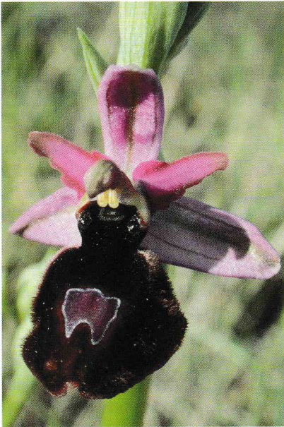
Ophrys magniflora (Corbieres)