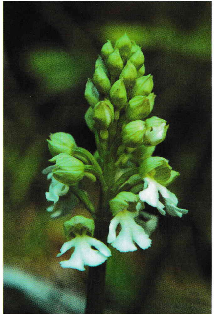
Fig 3: Orchis purpurea - straw hooded albino.

Demares, M. (1997) Atlas des Orchidees Sauvages de Haut-Normandie, 213 pp., Societe Francaise d'Orchidophilie., Elbeuf.