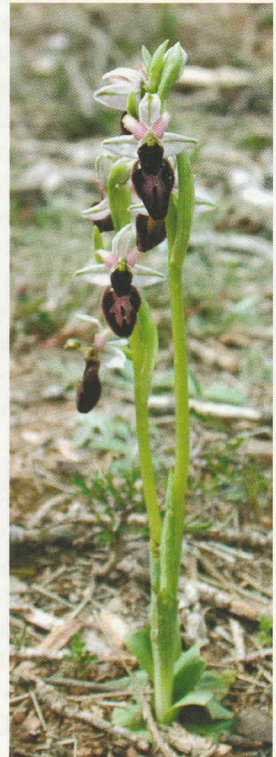
Ophrys catalaunica

Also frequent was our old Spanish friend O. tenthredinifera , but the greatest interest and novelty for us lay in the O. fusca group, which were quite abundant and in considerable variety. The ‘ordinary’ fusca was the commonest form, but the very local variety O. fusca ssp. atlantica (or is it now just O. atlantica ?) was also present in good numbers and just at the peak of its flowering. This plant is confined to the southernmost parts of Spain and nearby areas of North Africa, and is unmistakable with its large, very dark lip with a blueish pattern at the base. We also saw a version which was pale yellow-green throughout (var.