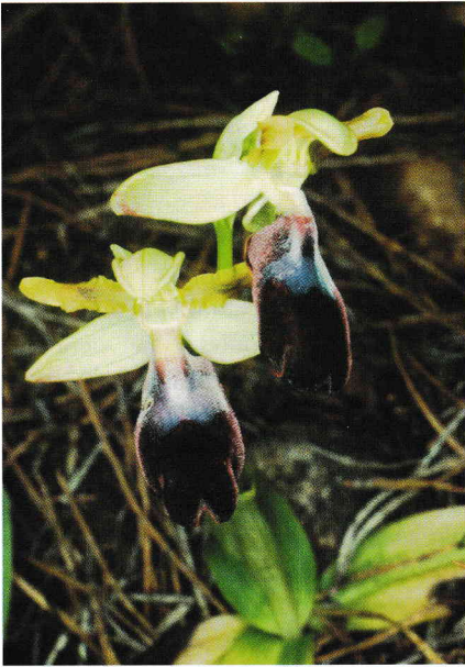
Ophrys atlantica