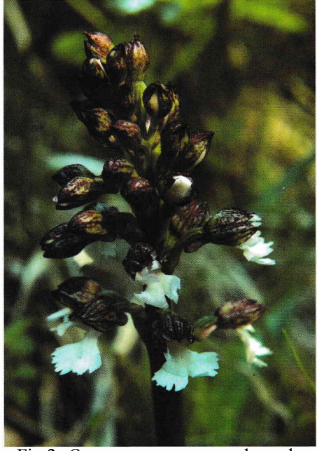
Fig 2: O. purpurea - green and purple hood.

est in wild orchids that began back in the late 1970's. As a fan of the true Orchis species, one of my more memorable early orchid trips was to Yocklett's Bank nature reserve in Kent where at the time there was a quite spectacular display of Lady Orchids. The highlight was finding an albino specimen with an unmarked lip and pure green hood (Figure 1). This plant was reasonably isolated but growing alongside one other plant of similar form with an unmarked lip but possessing a distinctive mottled green and purple hood (Figure 2). This plant was quite unlike the many varied but typically coloured plants that were present and, perhaps rather fancifully, I like to think of it as an intermediate form: something of a half way house between the albino and fully coloured plants. These two Lady Orchids were present when I visited Yocklett's Bank in 1980 and 1982, although strangely they were both absent in 1981.