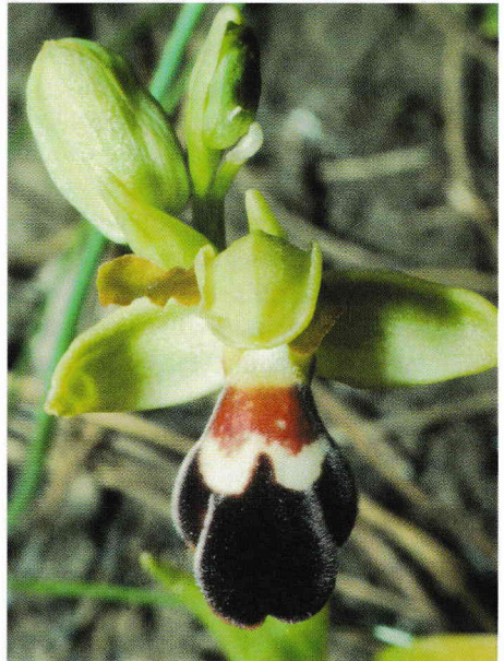
' Ophrys fusca ' omegaifera type

Anacamptis (Orchis) collina 1; Ophrys bombyliflora 1; Cephalanthera longifolia 1.