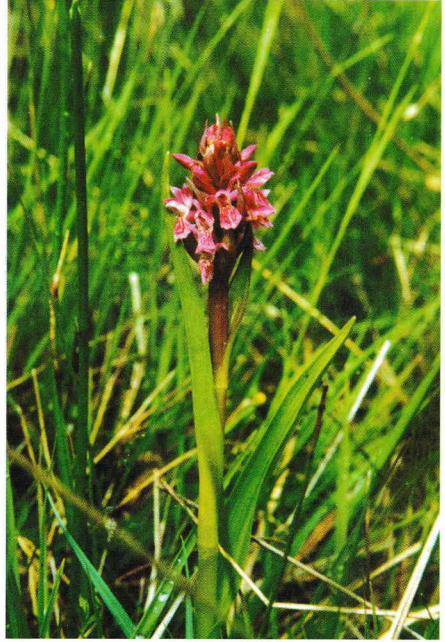
The top two and bottom left photos are florally polychromic specimens of D. incarnata ssp coccinea from Newborough in Anglesey. The bottom right photo is a D. incarnata ssp incarnata with red flowers from an Anglesey fen.