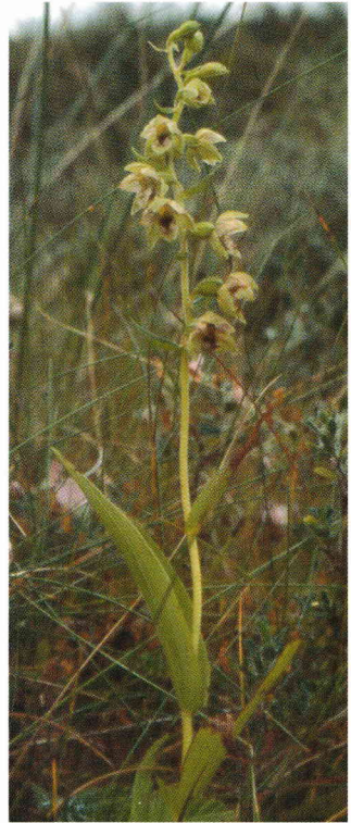
Epipactis helleborine aff. youngiana