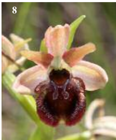
Fig.8 (above): Ophrys virescens

first visit but we were dismayed to see how many had been flattened by carelessly placed feet. Even in these miserable conditions the orchids were beautiful and we were pleased to see a good colony of Op. aveyronensis on the slope. As they were off the beaten track they had fared rather better than those in the car park, indeed it seemed that very few people had explored that area. The clusters of different orchids all the way up the hillside continued to delight us even on our fourth visit in two years. If it is going to grow anywhere, it is going to grow here, it seems, and in addition to those species seen