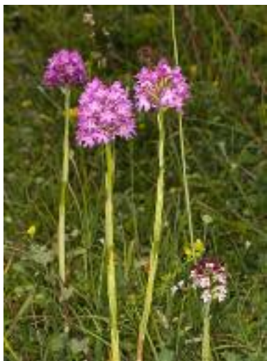
Pyramidal Orchids with Burnt Orchid at Ladle Hill

lateness of flowering this year. However, a sudden hot dry period occurred and many of the Frog Orchids were past their best and the Common Spotted-orchids had gone over. Some of the participants went on to an Oxfordshire reserve to see Marsh Helleborines and were rewarded with a bonus – apart from thousands of Marsh Helleborines, a dozen or so Marsh Fragrant-orchids were found in excellent condition.