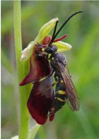
Fig. 9: Ophrys insectifera with Argogorytes mystaceus

In the first case, the names of the two parents are combined as ‘ Ophrys apifera × insectifera ’, with the added proviso that, if the seed parent (female) is known, her specific name should be placed first. By this convention, one might refer to the Bee × Fly hybrids with pink sepals as O. apifera × insectifera , whereas those with the opaque green sepals would be O. insectifera × apifera . In the second case, where the hybrid has been correctly described and published, a hybrid name such as ‘ Ophrys × pietzschii ’ may be used. However, since only one such name is permitted for all hybrids between a particular pair of species, it is then not possible to indicate which is the seed parent.