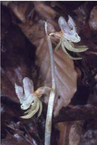
The first published photograph of the last proven record of Ghost Orchid from Oxfordshire, at Great Bottom/Ovey's Wood on 7th October 1979. Found by chance, and possibly the latest flowering time record of Ghost Orchid in the world.

almost every year subsequently, up to 1963. These records were all much later in the season than previous ones from the wood, all in September. Dates and numbers remain unpublished, however, and there are no records from this part of the wood since. Following up on this information, Vera Paul found five spikes at Great Bottom Wood, very near to where the 1933 plants were found, on 17 th September 1963. There was a further small group of plants coming out from underneath a stone. All of the plants were “barely in bud”. They were found in a ridge of humus pushed up by a tractor, and the underground stolons were visible, and extended several yards. By using slug pellets, the plants were kept alive until 8 th of October. The name of the wood was published in the proceedings of the BSBI in July 1958, but not the actual location. This may have had an adverse effect on the plants, as Vera’s location was partially cleared in the early 1960’s, resulting in ground disturbance and ingression by Willowherb and Bramble. The slope is these days covered in Dog’s Mercury and other species, but there are still good areas of clear woodland floor with fruiting fungi. However, other nearby parts of the wood are now much more suitable for Ghost Orchids.