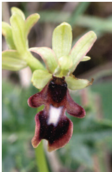
Plate 9: Ophrys insectifera , sepal-like petals

Plants with a double lip have been recorded near Arundel by Barry Tattersall [Plate 11]