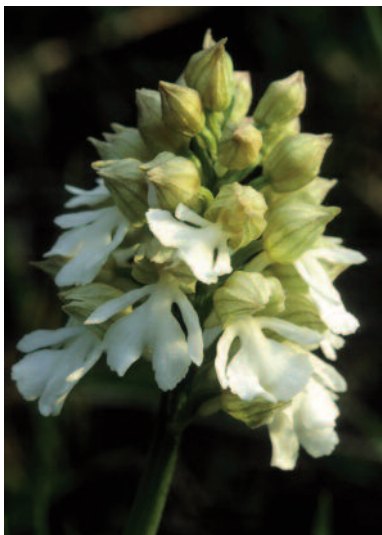
Straw hooded Orchis purpurea from France in 2004 (above) and two different pale variants from Kent 2005 (below)

Readers of the April Journal probably noticed that the French straw hooded Lady Orchid was missing from page 47. It is included here together with a close up of the green hooded plant photographed at Yockletts Bank in the 1980s.