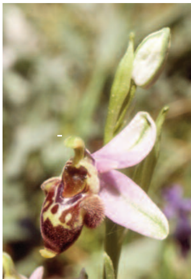
Ophrys dodekanensis

The last day we went up to the far north of the island and by the roadside found a very apple green Op. bucephala with some very leafy Serapias bergonii , before climbing up the slopes of Mount Pelineon mainly to see the early Op. dodekanensis . This was recently described from Rhodes and we found it in a meadow with thousands of O. anatolica . On the way we saw several species including