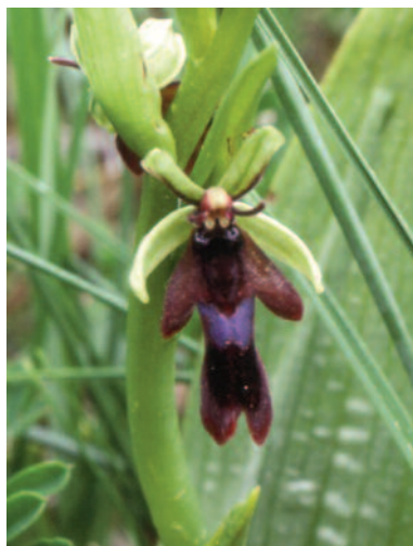
Plate 10: Ophrys insectifera , multiple sepals and petals