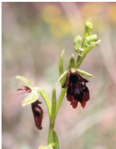
Plate 3: Ophrys insectifera var. subbombifera