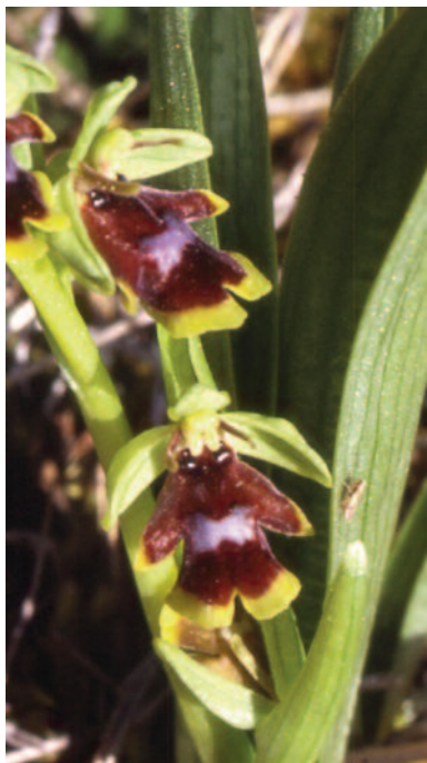
Plate 6: Ophrys aymoninii . Photo by John Spencer

There are two other species in the Op. insectifera group which have a yellow-edged labellum. The first is Op. aymoninii [Plate 6] which is endemic to Aveyron and neighbouring départements in southern France. In addition to the yellow-edge, there are other differences from normal Op. insectifera plants: the labellum is more brightly coloured and broader (almost as wide as long when spread out), the side lobes are also more spread-out, the two antennae-like petals are yellowish-green (not purplish-black), the sepals are longer relative to the labellum, and the gynostegium (pollen sac)