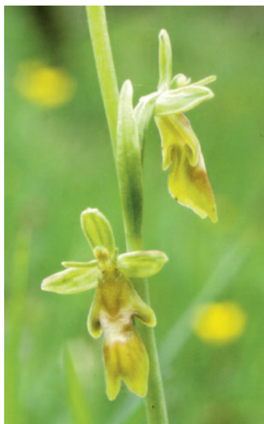
Plate 2: Ophrys insectifera var. flavescens

This variety partially lacks the anthocyanin pigments of the normal form resulting in a yellowish-brown labellum with a pale blue or whitish speculum and greenish-brown petals. In the UK, two plants [Plate 2] were recorded in Gloucestershire in 1999 by John Spencer. On the continent, this variety, and similar partially achromatic plants with a greenish-brown labellum, have been recorded at Gilsdorf in the Eifel Mountains in Germany and near Lofer in Austria. Pictures of plants from Baden-Württemberg and the Eifel mountains, Germany are also shown in “ Die Orchideen Mitteleuropas und der Alpen ” (Presser, 2002). Just as Op. apifera var. flavescens is used by some authorities as a synonym for Op. apifera var. chlorantha (see, for example, comment by D. M. Turner Ettliger in Watsonia 22: 105), so Op. insectifera var. flavescens is sometimes also used as a synonym for Op. insectifera var. ochroleuca .