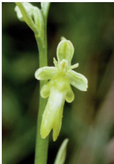
Plate 1: Ophrys insectifera var. ochroleuca