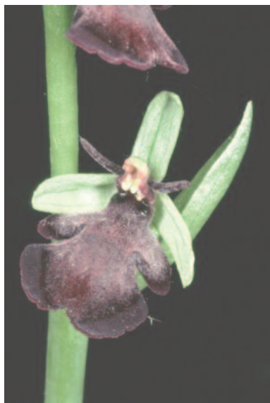
Plate 8: Ophrys insectifera , no speculum

As reported above, a var. subbombifera plant without a speculum [Plate 8] has been recorded by Barry Tattersall in N. Hampshire and is also illustrated in Orchids of the British Isles . An otherwise normal form without a speculum from Thüringen, Germany is shown in Die Orchideen Mitteleuropas und der Alpen .