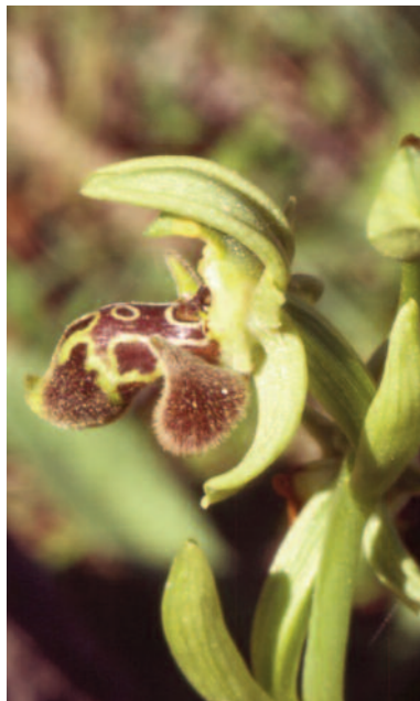
Ophrys bucephala