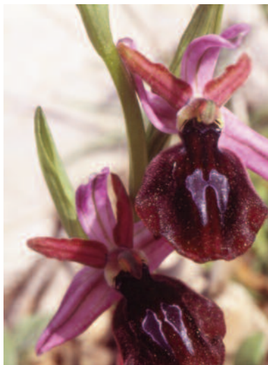
Ophrys ferrum-equinum