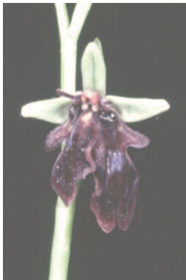
Plate 11: Ophrys insectifera, double labellum