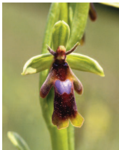
Plate 5: Ophrys insectifera forma luteomarginata with greenish-brown petals