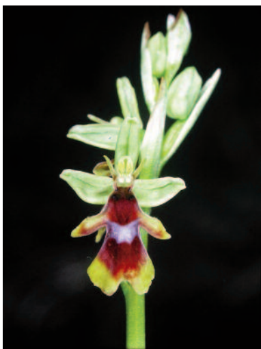
Plate 4: Ophrys insectifera forma luteomarginata with green petals

The lower edges of the divided central lobe of the labellum of Op. insectifera are often of a lighter brown or reddish-brown than the area immediately above. However, in a particularly striking form of Op. insectifera the central lobe of the labellum is brown with a broad yellow or greenish yellow band along its lower edge, sometimes with partly yellow side lobes. In Britain, this form [Plate 4] is best known from a marsh in Anglesey where was first discovered in 1995 by the Warden, Les Colley, and is still extant (12 spikes in 2005). However, the first record of this form in Britain appears to be a single plant [Plate 5] found by John Spencer on 21 May 1988 in the Cotswolds near Gloucester. As described and illustrated in “ Orchids of