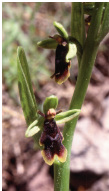
Plate 7: Ophrys subinsectifera