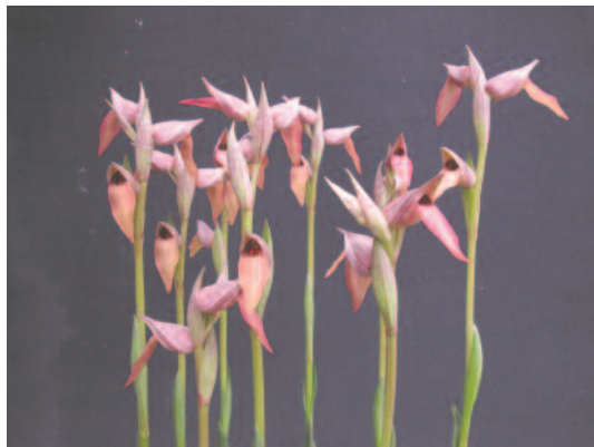
Jim Gooch's Class 12 winner Serapias lingua

(There were no entries in Classes 1, 2, 4 and 5 )