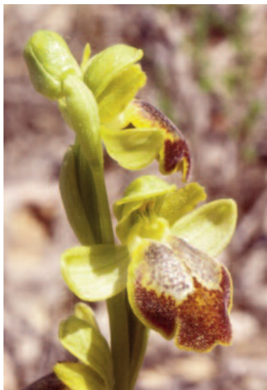
Ophrys parosica

from other species. He also showed us at least five different ways we could tell Op. phryganae from Op. sicula . It was the only place we saw Anacamptis papilionacea plants, which were well past their best as were some Ophrys sitiaca standing near the roadside.