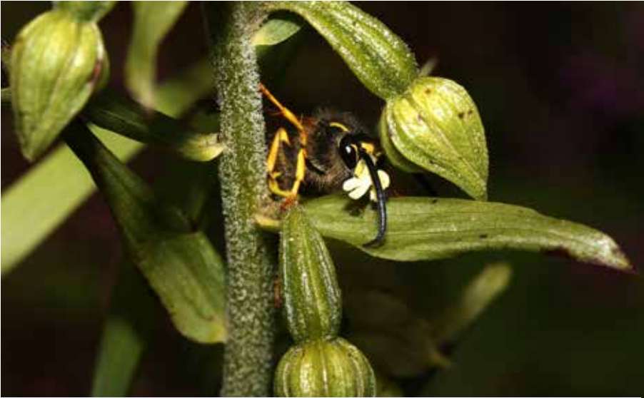
Fig 8: Dolichovespula sp. male with multiple pollinia on its clypeus. Note the long antennae of the male. (Figs 6-8 from Swanton Novers Great Wood, 6 th August 2012)