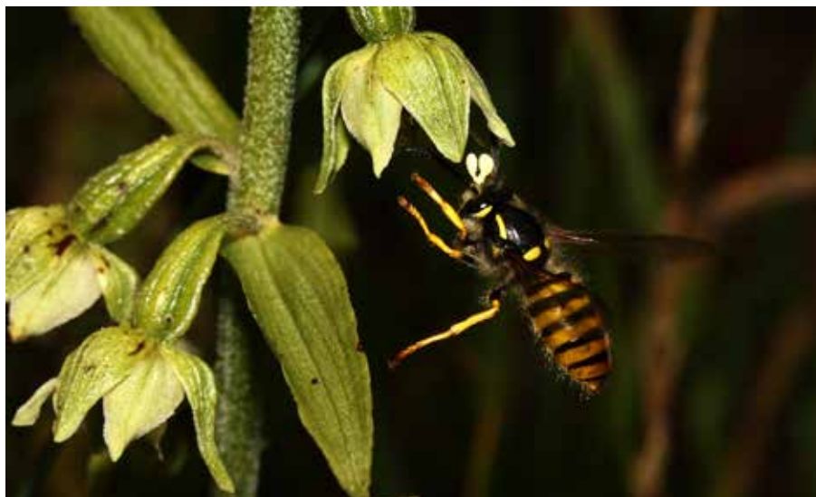
Fig 6 (top): Dolichovespula sylvestris male taking nectar from Broad-leaved Helleborine.