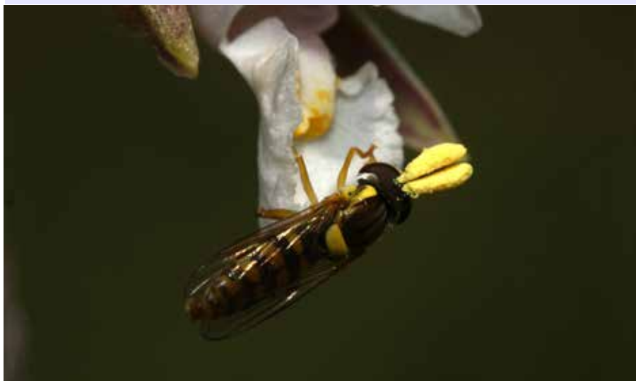
Fig 5: The hoverfly emerges with pollinia on its head. The epichile is hinged down again by weight of insect.