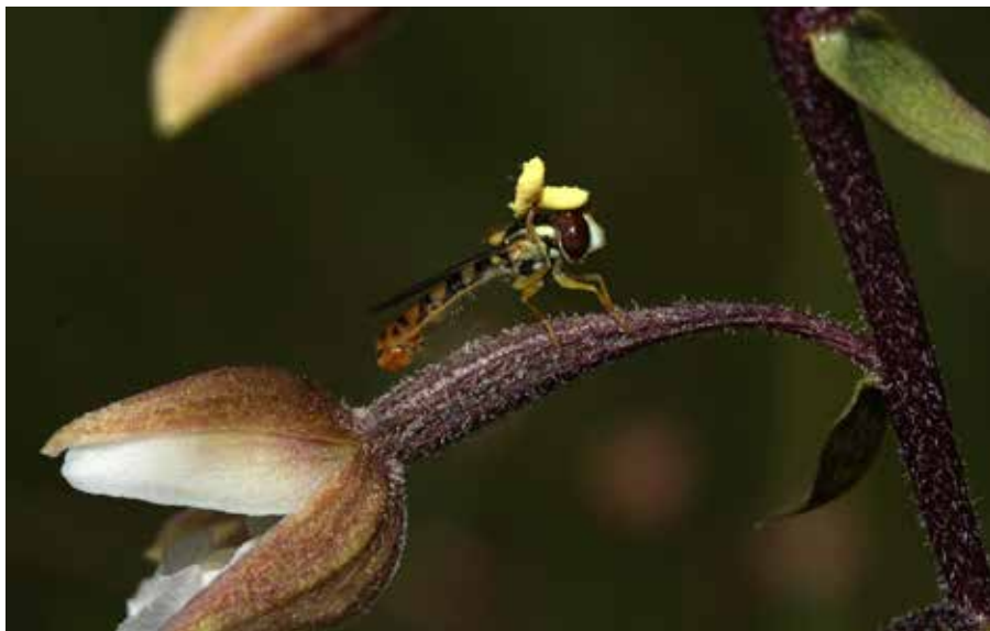
Fig 4: The hoverfly attempts to groom pollinia from its thorax, but is unable to do so