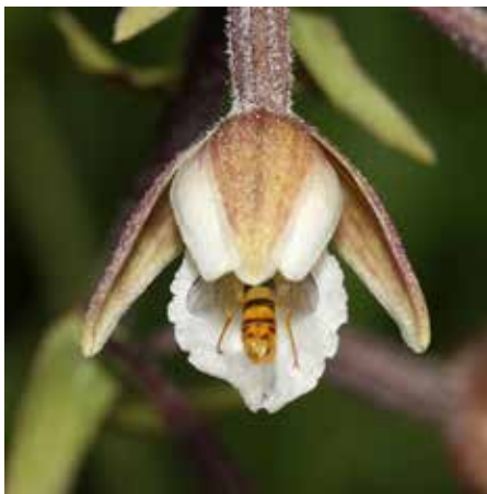
Fig.1 (left): Epichile hinged down