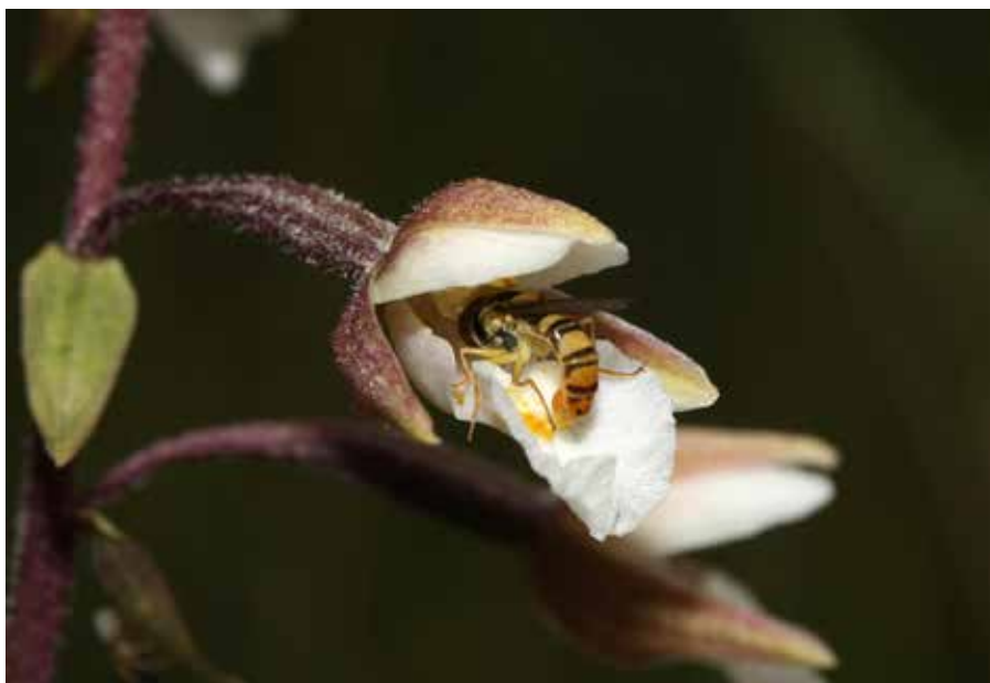
Fig 3: Hoverfly with weight partly transferred to the hypochile: epichile hinged up. The insect's middle legs are inserted round the front edge of the epichile, perhaps assisting the forward and upward projection of the insect as the epichile hinges upwards.