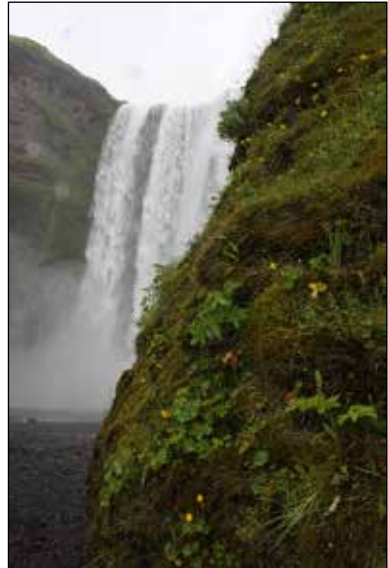
Dactylorhiza maculata ?subsp. islandica sheltering in the lee of a volcanic crater, Kerith, near Selfoss, Iceland.