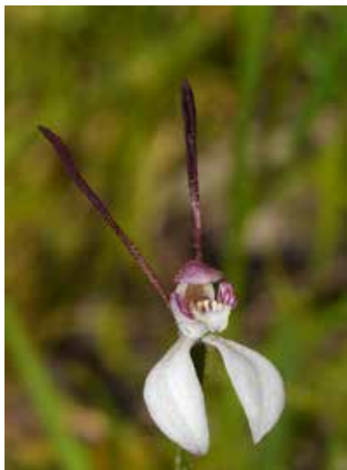
Fig. 7: Leptoceras menziesii