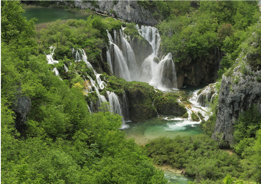
Figure 12 (above): Lower waterfalls, Plitvice National Park Figures 13 & 14: Ophrys dinarica Figure 15: Anacamptis (Orchis) fragrans Figure 16: Anacamptis (Orchis) coriophora

Approaching the park from the north, we stopped near Begoval to view thousands of Neotinea (Orchis) tridendata together with smaller numbers of Anacamptis morio , Dactylorhiza (Coeloglossum) viridis and Neottia (Listera) ovata on open grazing land much like alpine meadows. The weather on arrival was heavily overcast and we encountered occasional light rain, as is often the case in the mountains surrounding the park. However, for the remainder of our stay we were fortunate to have extremely bright and sunny conditions. Our longstanding tradition of not arranging hotels in advance backfired when we arrived at Plitvice, since all three hotels (which are situated within the national park) were fully booked. What we fin-