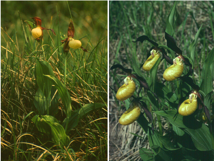
Figure 4: Comparison of the last remaining native individual of Cypripedium calceolus (left) with a flourishing population of this species in the Vercors region of southeast France (right).

across the slope during the last three decades. Nonetheless, there exist few more obvious desperate cases for conservation intervention. Since 1983, a well-funded research programme has applied several different horticultural approaches in an attempt to propagate new individuals that share all, or at worst half, of their genes with that one remaining wild plant in Britain (e.g. Ramsay & Stewart 1998). In the last 20 years several thousand aseptically produced young plants have been introduced to 23 localities in northern England, at least one of which is now open to visitors. Although these plantings have suffered very high mortality, and survivors have been slow to flower (Harrap & Harrap 2009), these reintroductions are widely regarded as a qualified success.