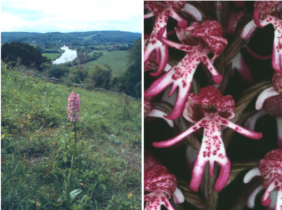
Figure 1: Lonkey Orchid ( Orchis ×angusticuris ), shown in its habitat at the BBOWT Hartslock Reserve, Oxfordshire (left) and in close up (right).

At the time of writing (July 2010), an energetic series of exchanges has just been posted on the HOS discussion forum in response to the news of a substantial increase in numbers of anthropomorphic Orchis plants present at the Berkshire, Buckinghamshire and Oxfordshire Wildlife Trust's (BBOWT) famous Hartslock Reserve, near Goring in Oxfordshire. More specifically, concern was expressed at the numbers of flowering and especially non-flowering plants identified as hybrids between the Monkey Orchid ( Orchis simia ) and the Lady Orchid ( O. purpurea ), hereafter termed the Lonkey Orchid ( O. ×angusticuris ; Fig. 1). Total numbers of the hybrid over the period 2006–9 were reported as 23 (7 flowering), 29 (11), 72 (12) and about 130 (27) (cf. Raper 2006–10; Bateman et al. 2008; Cole 2010). The corresponding total for 2010 was reported as 300, of which 77 flowered (Bill Temple, pers. comm. 2010; Raper 2006–10). In contrast to the near-exponential increase in the hybrids, numbers of the parental species were fairly stable over this period at about 400 Monkey Orchids and a modest increase from 7 to 23 Lady Orchids.