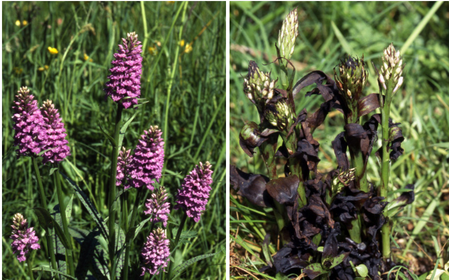
Dactylorhiza hybrid (left) and the effect of “Dactylorhiza blight” (right)

garden from the other affected clumps. Has anyone found a way of treating this blight, or does it mean that we must forget about growing these spectacular plants? How widespread is it – I rarely see it mentioned.