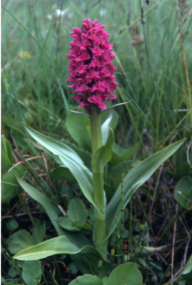
Figure 6: Is the near-endemic Northern Marsh-orchid of greater value to international conservation than our sole native Lady's Slipper?