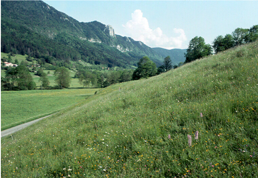
Figure 3 (above): Hybrid swarm of Lady and Military Orchids in the Vercors, southern France.