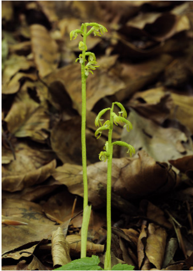
Figure 13: Corallorhiza trifida

ished up doing was renting rooms for three nights in a nearby village, but making use of one of the hotels facilities for all our meals and this arrangement worked out fine. The orchids we did get to see at Plitvice included Orchis militaris , Ophrys insectifera , Dactylorhiza incarnata , Platanthera bifolia , Corallorhiza trifida , and budding Epipactis microphylla and helleborine . Among the many other plants seen were Bastard Balm, Balm-leaved Archangel, Spiked Rampion, and Angular and Scented Solomons Seal. Butterflies included Southern Swallowtail, Scarce Swallowtail, Woodland Ringlet, Pearly Heath, Balkan Green-veined White, Green Hairstreak, Cleopatra, Large Tortoiseshell, Chequered Blue and Red Underwing Skipper plus several day flying moths. Over 300 species of Lepidoptera have been recorded from Plitvice alone.