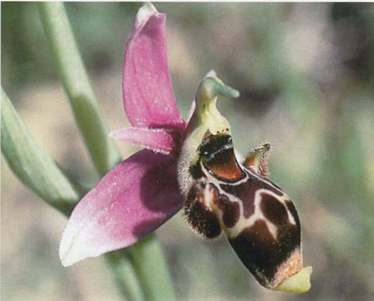
Ophrys picta , Algarve