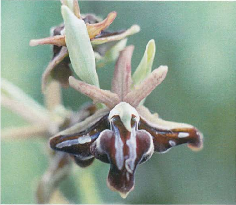
Ophrys mammosa as in Bateman & Rudall's article on floral mutants where additional labella had been expressed in the lower halves of each lateral sepal.