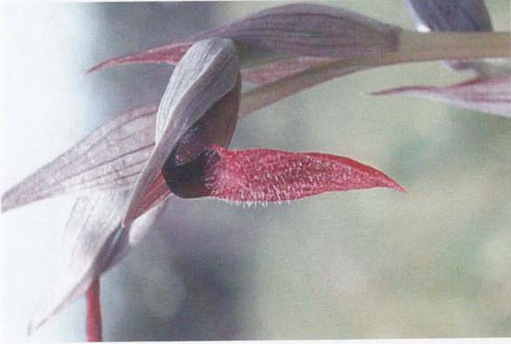
Serapias stricta - Algarve