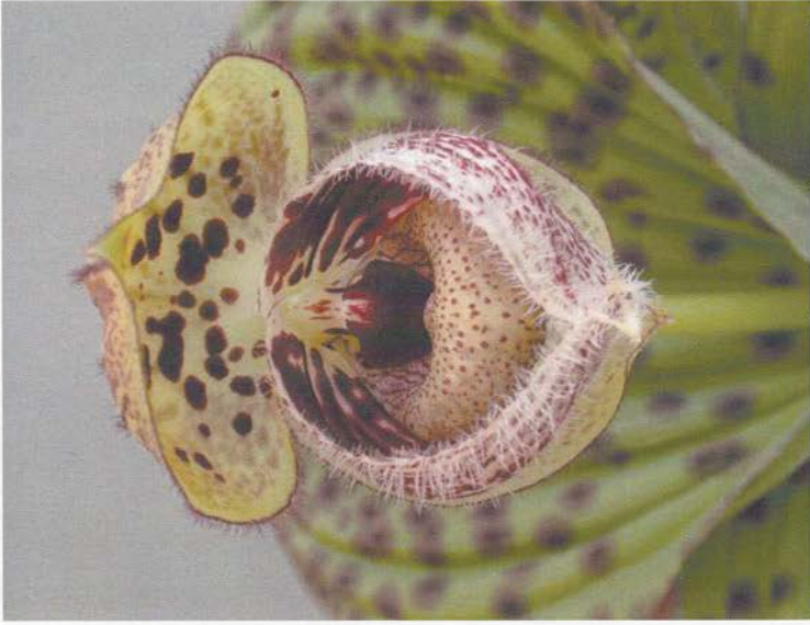
Class 8 Cypripedium fargesii Barry Tattersall "Best in Show"