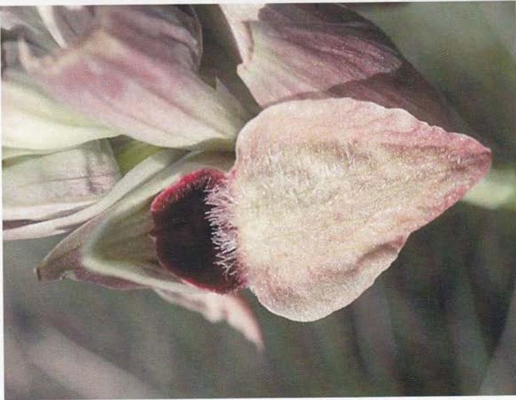
Serapias cordigera - Algarve