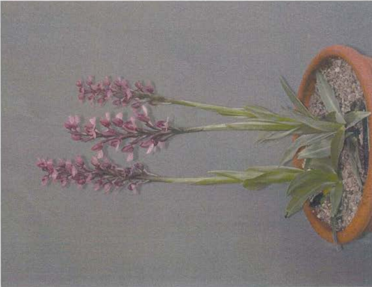
Class 7 Anacamptis (Orchis) papilionacea var grandiflora Colin Clay