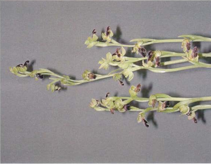
Class 11 Ophrys fusca Liz Copas