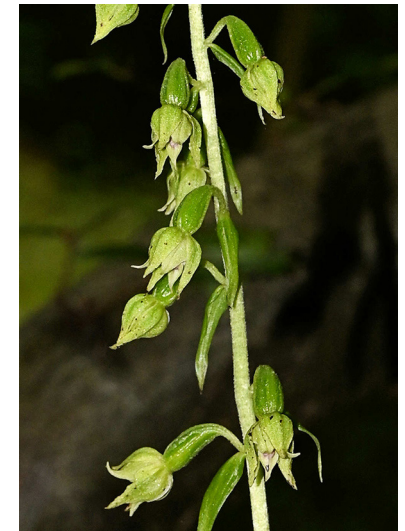
Fig. 1 (opposite): Three stems of Narrow-lipped Helleborine. Fig. 2: (above) Close-up of a Narrow-lipped Helleborine stem. Note the nodding flowers. The epichile can just be seen on some of the flowers.

In mid-July 2023, similar helleborine plants were found by the authors, including three close-together flowering stems (Fig. 1). The plants, on closer examination, showed some interesting features indicative of Narrow-lipped Helleborine, a nationally scarce orchid, which has been recorded in other nearby counties along the Chilterns, including Hertfordshire, Oxfordshire and Buckinghamshire. The flowers had a narrow pointed epichile, coloured green and pink. Many of the flowers were drooping (Fig. 2) much like a Green-flowered Helleborine ( Epipactis phyllanthes ). However, the colour at the back of the hypochile was red, unlike Green-flowered Helleborines where it is green.