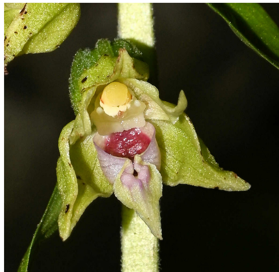
Fig. 4: Close-up of one of the Narrow-lipped Helleborine flowers, with the pollen just starting to crumble onto the stigma.

Normally, Narrow-lipped Helleborines grow on limestone or chalk soils. With Chalky Boulder Clay the amount of chalk or limestone can be very variable. Richard also notes: “The lip shape, colour, posture of the flowers, and vegetative characters are all consistent with leptochila (though I’d tend to view this occurrence as being three plants rather than one, while recognising that the three stems might originally have shared the same rhizome).” A later email from Richard also notes that in the new UK plant atlas Epipactis leptochila is rapidly declining post-1987.