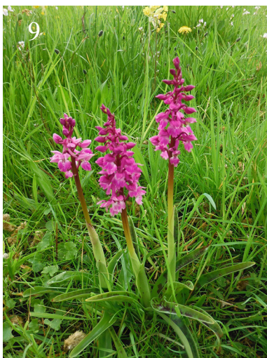
Figure 9. Three mature Orchis mascula growing in one small area under the Willow Tree (also see Fig. 5).

Our orchid meadow has had an impact at several levels. At one level it could be regarded as an experiment. We have demonstrated that southerly distributed species such as White Helleborine, Southern Marsh-orchid (current natural northern distribution limit c. 30 km north of Newcastle-upon-Tyne), and Green-winged Orchid (northerly limit in Ayrshire – see https://database.bsbi.org/maps ) are able to grow, from seed, much further north in our meadow near Blairgowrie. Our meadow has also provided new insights into the development of orchids. We know, for example that Broad-leaved Helleborine (BLH) can develop from seed to large, mature plants in just three years (Trudgill 2019), whereas White Helleborine took six years. We know this because we know when the seed was first spread. And we know that BLH has a preference for growing near trees because this is the only place where it grows although the seed was initially spread across the whole of the meadow. Also, the development of the BLH to a plant large enough to flower appears to have been entirely below ground.