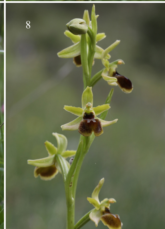
Fig. 4: Orchis × bergonii ( Orchis anthropophora × simia ), Rochefort Samson St-Gens, 12 th May.