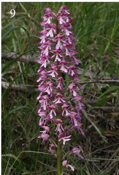
Fig. 9: Orchis × angusticruris ( Orchis purpurea × simia ). Col du Prayet, 10 th June.

a splendid lip (the subspecies is smaller) as well as the hybrid Op. fuciflora ssp. demangei × Op. drumana . This had the colours and markings of the Op. drumana lip. Then we had much prettier find; a yellow-albinistic form of Op. drumana .