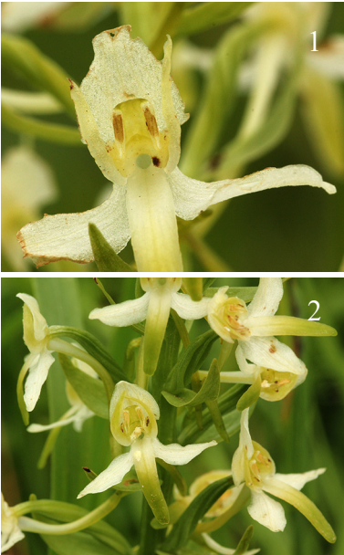
Figs. 1 and 2: Platanthera sp, Edge, 2 nd June 2017, amongst a colony of P. chlorantha .

UK field guides all agree that the best way to distinguish between the two species of Platanthera that occur here is to examine the pollinia; ‘close together and vertically parallel’ in Platanthera bifolia , Lesser Butterfly-orchid, and ‘relatively far apart and diverge sharply from the top downwards’ in Platanthera chlorantha , Greater Butterfly-orchid, according to Ettliger. Harrap & Harrap (2005) and Cole & Waller(2020) provide illustrations showing obvious differences in the pollinia.