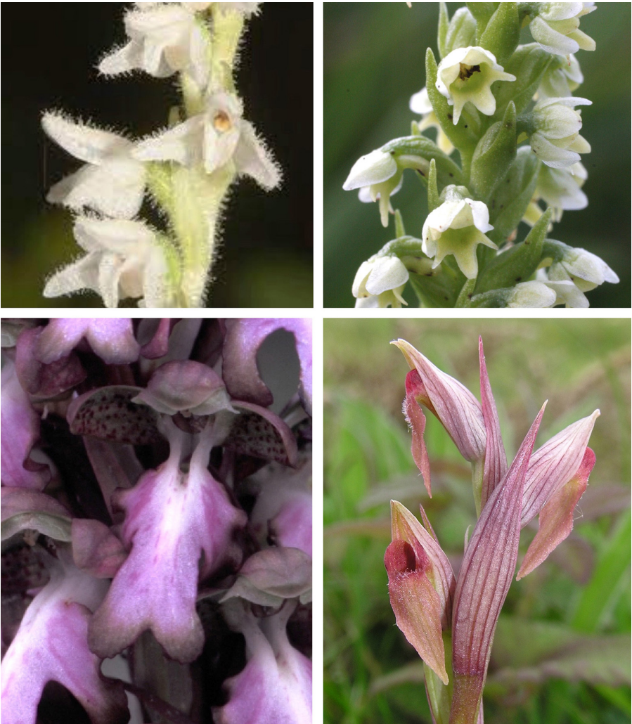
Fig. 2: Possible winners and losers in the face of the rapidly approaching 2°C rise in mean annual temperature. Cold temperate/high altitude specialists such as Creeping Lady's-tresses ( Goodyera repens , top left) and Small-white Orchid ( Pseudorchis albida , top right) are already showing signs of retreat within the British Isles. In contrast, more southerly species native to mainland Europe, such as Giant Orchid ( Himantoglossum robertianum , bottom left) and Small-flowered Tongue-orchid ( Serapias parviflora , bottom right), are actively migrating northwards.