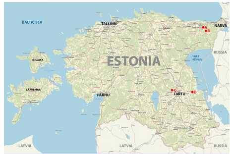
Fig. 18 Location of study sites

to that of either neighbouring populations or others elsewhere in the country. To demonstrate this, I chose two pairs of locations close to each other, in different regions: A & B in north-east Estonia and C & D in the south-east of the country (Fig. 18). A & B have the same temperatures as each other throughout the year, the same amount of sun and clouds and the same amount of rain and humidity. The same is true for C & D (distances between these places: A-B=5km; B-C=110km; C-D=33km).