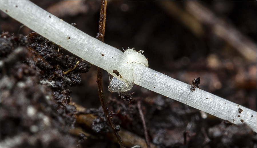
Fig. 10: Epipogium aphyllum bulbil with new rhizomes.

These delicate structures are the means by which the species reproduces vegetatively, so it is not difficult to imagine the effect that even the most careful footfall will have on the spread of Epipogium among the soft, damp substrates in which it flourishes best. For this reason, sites for this species should not be visited repeatedly or by large numbers of people.