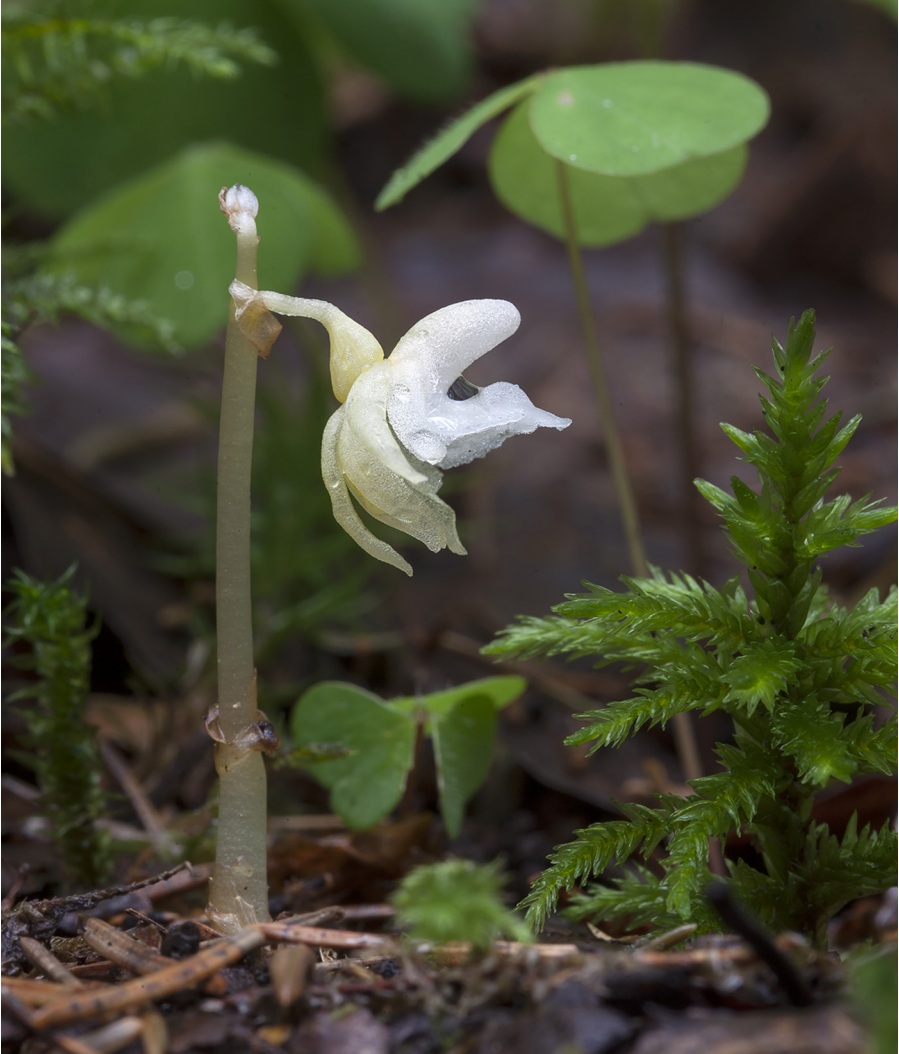
Fig. 19 “ Epipogium aphyllum forma albiflora ”

E. aphyllum has only one named variant – the rarely-occurring forma albiflora where the flowers lack anthocyanin (red colour), giving the plant an overall transparent whitish to yellowish appearance. In August 2020 we found in one large population two separate clumps of strange-looking plants – even from a distance at first glance they looked different. They were overall “abnormally” reddish among many