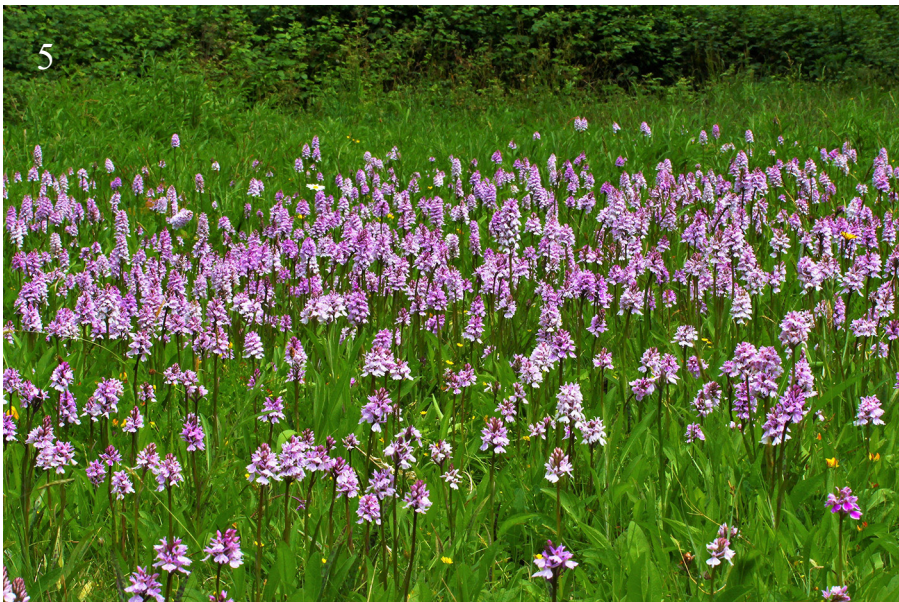
Fig. 5: Population of D. maculata at Southampton Common 2017, showing an anthocyanin-rich plant bottom right.

Apart from the above four sites, I was told of a further occurrence in the west of Scotland and Lang (2004) refers to examples having been recorded in Merioneth, Wales. No doubt after the latest Dartmoor record, others will crop up in the future.