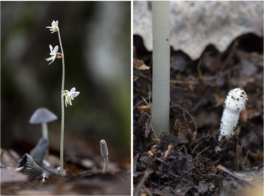
Fig. 11: Epipogium plants with Coprinus sp. very close by on 21 st November