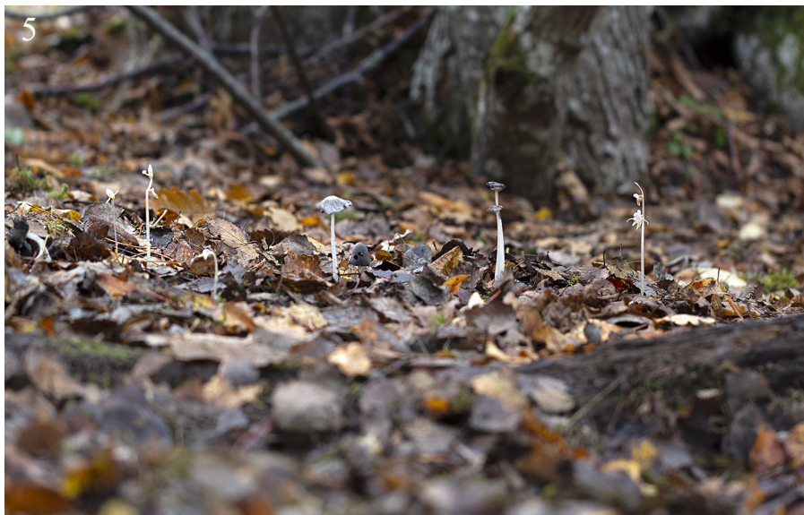
Figs. 3 & 4: Epipogium aphyllum coming into bud among autumnal leaf litter. Fig. 5: First Epipogium aphyllum flower opening amongst six plants.

The weather during the interim had minimum temperatures of 1-2°C at night and a maximum of 6-11°C during the daytime, with the 24h average being 6-7°C. The plants were in my experience medium-sized with up to three flowers, reaching 14cm on 29 th October, with a stem diameter of 3.5mm, so were no different in size or vitality to those flowering during the usual period.