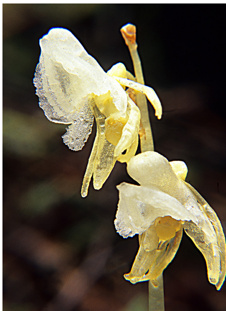
Epipogium aphyllum var. alba