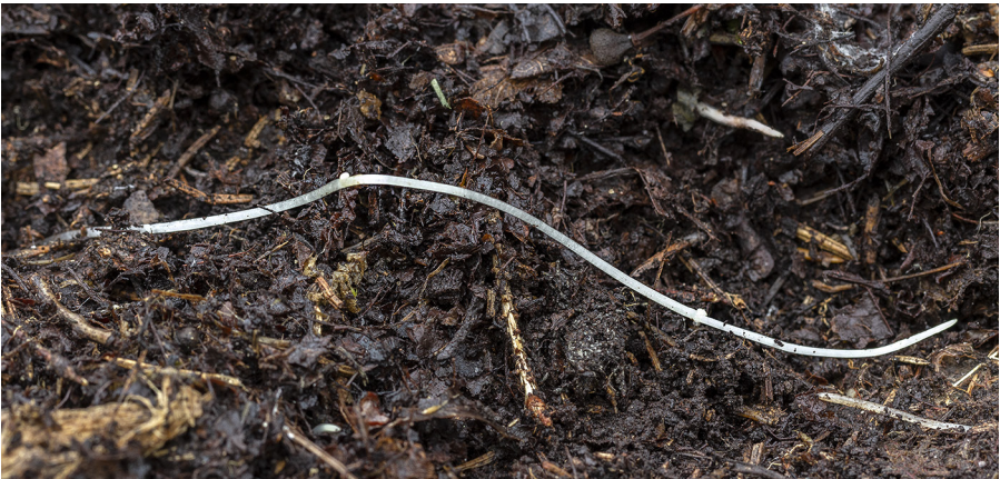
Fig. 9: Stolon of Epipogium aphyllum with two bulbils.