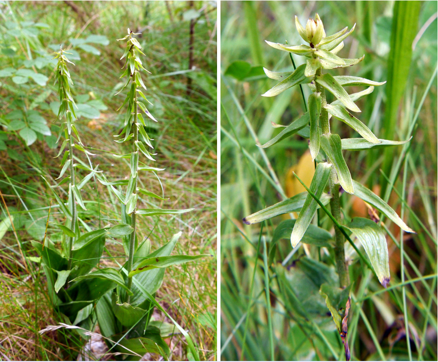
Figs. 5 & 6: The plants with flowerless spikes.