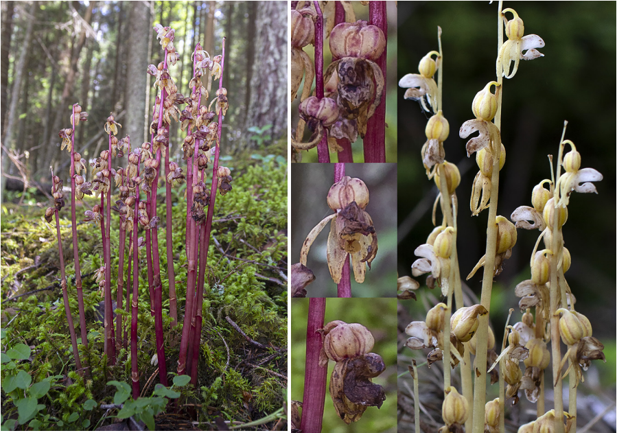
Fig. 20 “ Epipogium aphyllum forma rosea “

Given how rare this reddish form is, it is difficult to decide whether this is just coincidence or a more consistently occurring phenomenon. It is certainly worth further investigation should more plants of this form be discovered, and subsequently set seed. Maybe therefore, if the yellow form of Neottia nidus-avis is called forma sulphurea , this reddish form should be called Epipogium aphyllum forma rosea .