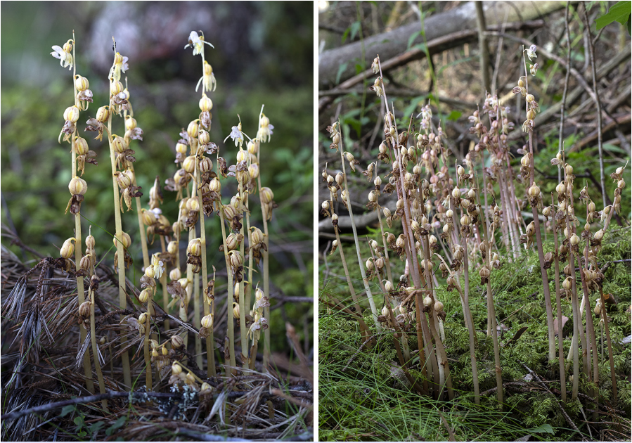
Fig. 17 Epipogium plants with extensive fruit set.