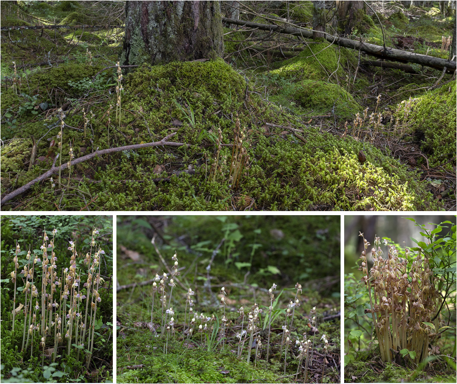
Figs. 12-15: Epipogium plants in probably the largest extant population in Europe.

After further visits we found additional plants in the surrounding area, bringing the total number to at least 3000, surely making this the largest extant population of Epipogium aphyllum in Europe.