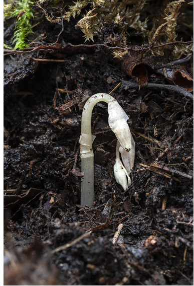
Fig. 8: Epipogium aphyllum plant with curled back stem.

The stolons of Epipogium are very thin and delicate, breaking even with the most careful movement of the associated leaf litter, or even the slightest accidental contact.