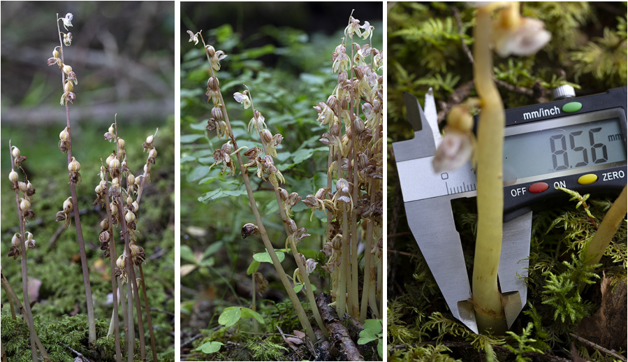
Fig. 16 One Epipogium stem with eight flowers and two stems nearby with seven flowers. Stems with diameter over 8mm are a sign of superb vitality.

It was a great thrill, then, when on 5 th August 2020, we discovered a single plant with eight flowers (Fig. 16). Nearby were two plants with seven flowers and many others with five or six. It seems to be that the bigger the population, the exponentially higher the probability of finding highly vigorous plants. In Estonia at least, within smaller populations (up to 10-20 plants) even five flowers on a single stem is rare. In places with just one or two plants usually four flowers is the maximum, but more often just one or two. Width (diameter) of stem (measured at the widest point, usually just above the base) is another indicator of plant vitality. Smaller plants usually have stem widths of 1-2mm, bigger plants with four or five flowers usually 3-4mm. Stems with diameter >5mm are rare. The largest plant we measured in 2020 had a stem diameter of 8.56mm – truly remarkable for Epipogium !