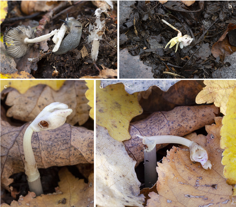
Fig. 7a: Krynockillus melanociphalus eating Coprinus sp. Figs. 7b - 7d: Slug damage to Epipogium aphyllum plants.

Whilst it might have been expected that the temperatures during these plants' emergence would have prevented slug predation, this was not the case. During the early part of emergence, daytime temperatures were reaching up to 10°C and three of the six plants were eaten or broken by slugs between the end of October and mid-November, whilst still in bud. Another three-flowered plant was eaten on 3 rd or 4 th November. I have recorded a lot of individuals of the non-native species, Krynockillus melanociphalus (Fig.7 below) eating Coprinus species. It is rapidly expanding in this area since first reported in Estonia in 2014, as are some Malacolimax sp. and other smaller slug species. In fact, slug presence and activity was much greater during the period of this observation than during the more usual flowering period of Epipogium , in July (and August) – this was especially the case for K. melanociphalus .