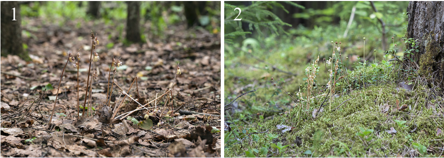
Fig. 1: Epipogium aphyllum growing out of old leaf litter.

In Estonia the Ghost Orchid Epipogium aphyllum is known from approximately 20 locations scattered throughout eastern and central regions, with additional occurrences on the islands of Saaremaa and Hiiumaa to the west. It typically occurs in moist Picea abies and Populus tremula forests, usually with minimal understorey, growing out of old leaf litter (Fig. 1) but sometimes on green moss (Fig. 2).