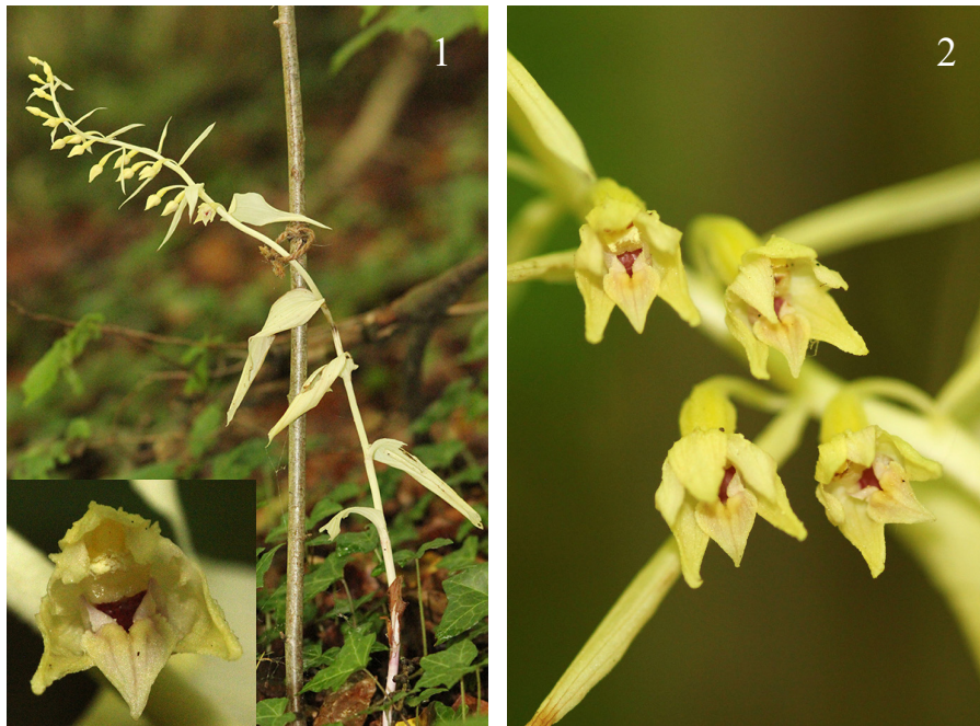
Figs. 1 & 2: Narrow-lipped Helleborines ( E. leptochila ) lacking chlorophyll on 30 th June 2017 (Fig. 1) and 5 th July 2017 (Fig. 2).

On 18 th June 2017 Alan Smith found a curious, ghostly pale Epipactis in the Cotswolds amongst a small colony of Narrow-lipped Helleborines ( E. leptochila ); although in bud the stem was bent right over and flattened but he suspected it was probably also E. leptochila . He returned the next day to stake and water the plant, hoping it would survive. On 29 th June the first flower bud opened and he was able to confirm the identification. On 1 st July there were four open flowers but the stem, where it had been bent over, was noticeably stressed and starting to brown. Eventually eight flowers opened but by 9 th July they had all faded and the stressed section of the stem was completely brown. It seems that Narrow-lipped Helleborines lacking chlorophyll are almost unknown, the only other record I could find is mentioned in Young (1962), a plant in VC11 in 1954 that persisted until 1957 and even this was probably not fully lacking in chlorophyll as the leaves are described as 'a pale greenish-yellow'. Lewis (2015) mentions achlorophyllous forms for various Epipactis , ten different species in total, but not for E. leptochila .