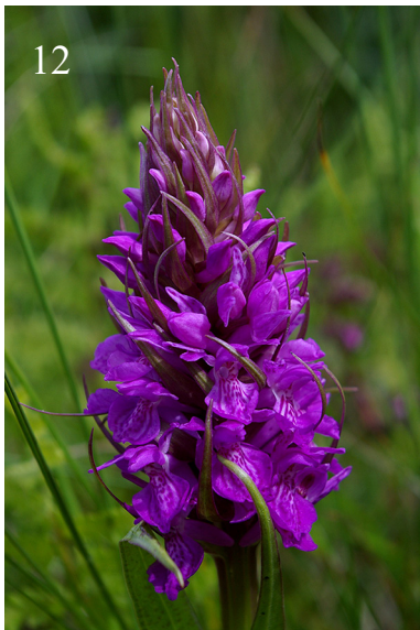
Figs. 11 & 12 plus back cover: Sutton Fen Marsh-orchids that could be D. praetermissa , D. incarnata or Dactylorhiza ×wintoni