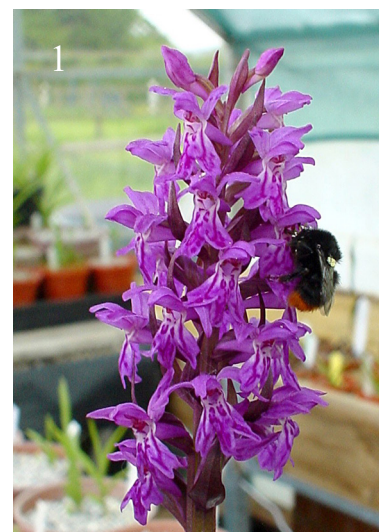
Fig. 1: Bumblebee visiting a cultivated specimen of D. majalis in the glasshouse. Pollinia are visible on the bee's head.

As alluded to at the end of my 2007 article (Haggar, 2007), I have long believed that ongoing interactions between Dactylorhiza incarnata and various species of incarnata -containing allotetraploid marsh-orchids have a profound effect on the former species. My suspicion that this may be the case arose when I first started cultivating Dactylorhiza species from seed and growing the plants in a greenhouse