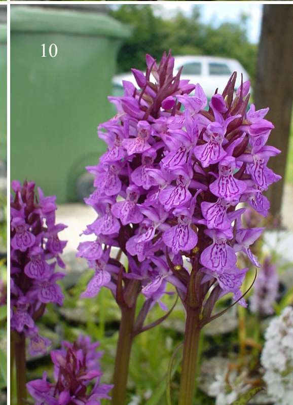
Fig. 7: D. incarnata parent of the D. ×wintoni hybrid in Figs. 8 & 9. Fig. 8: Cultivated D. ×wintoni from D. incarnata var. coccinea/dunensis (seed parent) × praetermissa (pollen parent). This specimen exhibits a praetermissa -like labellar patterning. Fig. 9: Another example of the same hybrid but exhibiting an incarnata -like pattern. Fig. 10: Cultivated D. ×wintoni from D. praetermissa (seed parent) × D. incarnata forma cruenta (pollen parent). This hybrid had bilaterally blotched leaves.