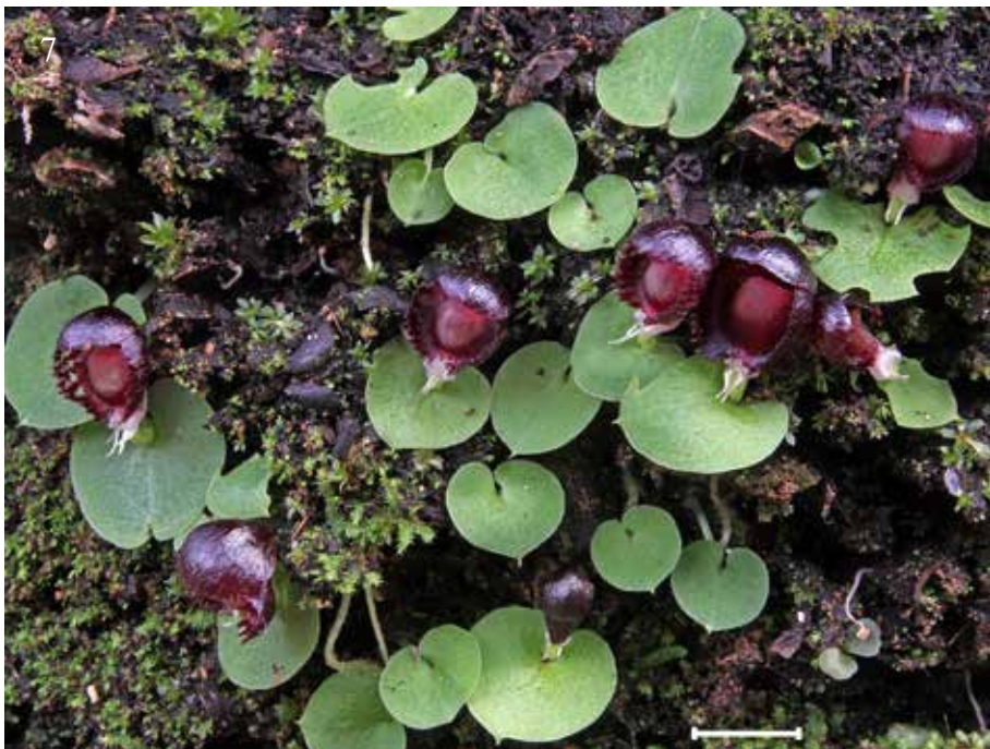
Fig. 7: Corybas recurvas . Margaret River, Western Australia. Bar 1cm.

the base of the labellum. The Cradle Orchid is widespread and common in Eastern Australia.