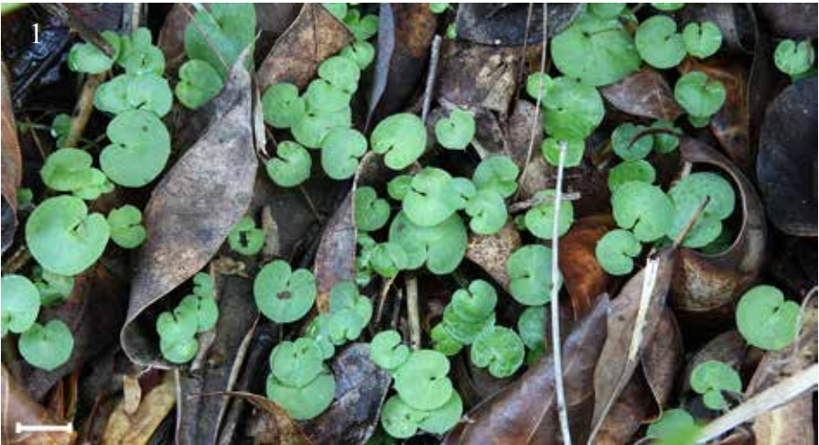
Fig. 1: Non-flowering leaves of Corybas fimbriata . North Sydney, NSW, Australia. (Bar 1cm).

Corybas leaves may be quite common in suitable localities but the number bearing a flower varies significantly from species to species and in many cases, large areas of non-flowering leaves can be found (Fig.1), although this is less evident among New Zealand's "Spider Orchids" (not to be confused with the Spider Orchids of the genus Caladenia in Australia).