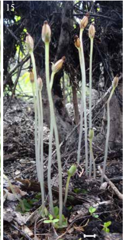
Fig. 14: Corybas rivulare . Mangamuka Gorge, North Island, New Zealand.