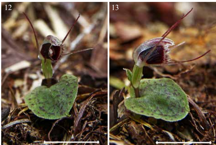
Figs 12-13: Corybas oblongus . Wairakau, North Island, New Zealand. Bars on figures 1cm.

forwards and raised about 45 degrees. In Corybas rivulare , in contrast, the labellum is tapering and trough-shaped, with the narrow dorsal sepal only loosely arched above (Fig. 14). It grows on river banks under light bush and is significantly larger than the other species considered here.