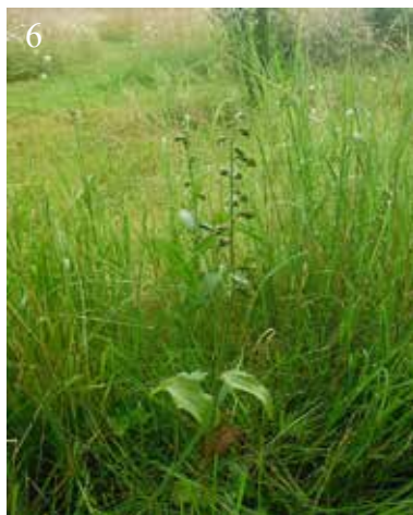
Fig. 4: Pyramidal Orchids, July 2019.

Trudgill, D.L. (2015) Orchid spread – Is it OK to give a helping hand, and is it needed? JHOS 12(4): 124-131.