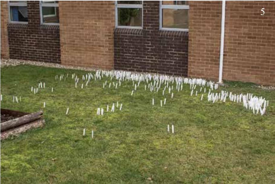
Fig. 5: Marked Bee Orchids ready for counting.

Over the years I have learned a number of things about these orchids. Perhaps the most important is that the best estimate of the number of orchids is obtained by counting the number of plants visible in February. At that time of year the leaves are silvery in appearance and therefore easier to distinguish from Plantains. This silvery colour starts to diminish in March at this site so that February is the best compromise between visibility, late emergence and rabbit predation. Naturally this conclusion only applies at sites that contain one species of Ophrys unless you have individual plants permanently labelled. It would of course be difficult and possibly dangerous to do this at sites accessible to the public with several species of Ophrys present. In order to obtain a more accurate estimate of the actual number of plants I mark each