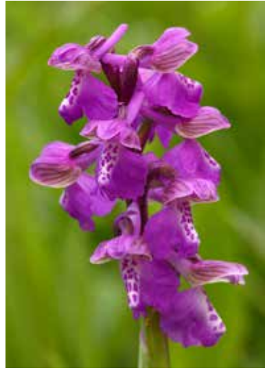
Green-winged Orchid Anacamptis morio

I have started a HOS conservation project for the Northumberland Wildlife Trust to re-introduce Green-winged Orchids to one of their former sites (they are currently extinct in Northumberland). The National Trust has kindly provided seed from a colony of Green-winged Orchids growing in the area of Silverdale. There are five society members trying to germinate the seed plus Writhlington School.