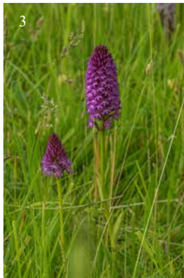
Fig.1: Pyramidal Orchid leaf rosettes in spring of 2019.

The success of Pyramidal Orchid in our meadow was a surprise. It clearly demonstrates that it will grow in our part of Scotland and its absence is unlikely to be because the climate is unfavourable as in 2018 a cold winter and spring ('beast from the east') was followed by a summer that was unusually warm and dry. The most logical conclusion is that its absence from north-eastern Scotland is due to a lack of seed reaching sites where the management and soil environment (including mycorrhizal fungi) are favourable to its establishment and growth (Trudgill 2015). Its apparent absence in western Scotland from most of the mainland is more of a puzzle as some coastal areas appear similar to those on the islands where it is present.