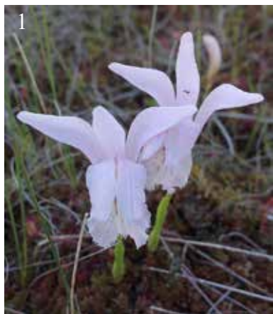
Fig. 1: Arethusa bulbosa var. albiflora

So, a good start for the first day. We decided to head north to find the early species and hoped that the later ones would be in bloom on our return. On the way we found lots of bogs covered in Dragon's-mouth Orchid, Arethusa bulbosa , a very pretty and normally rare orchid, but not here. As there were so many there were