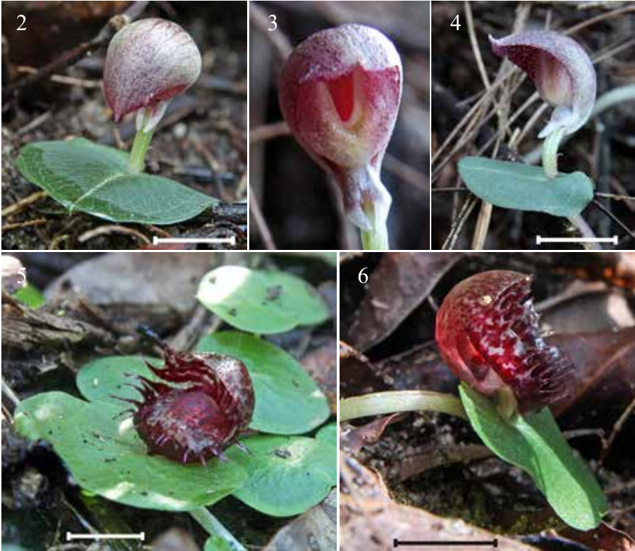
Figs. 2-4: Corybas aconitiflorus . Figs. 5, 6: Corybas fimbriata . Both North Sydney, NSW, Australia. Bars on figures 1cm.

In most species, the lateral petals and sepals are reduced to tiny threads, although they are present as elongated spines in the New Zealand “Spider Orchids”. The group has been split up into several different genera in Eastern Australia and New Zealand but these have not generally been recognised (Chase et al. 2015). We have selected a small group of species here to illustrate the range of features in these orchids.