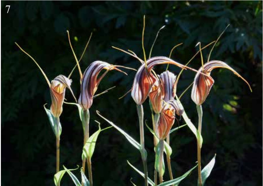
Fig. 7: Pterostylis coccinea