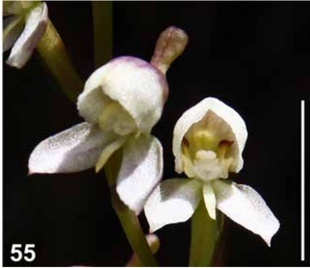
Figures 54-55. Disa uncinata

D. uniflora is an iconic flower of South Africa with its striking large pink to red flowers. It grows along stream banks and on wet cliff faces, usually with a single terminal flower but rarely with three or more flowers. Narrow, tapering leaves around the base of the spike are difficult to distinguish from the stream bank vegetation in Fig. 56. The dorsal and lateral sepals dominate, with a short, narrow, tapering lip between the inner ends of the lateral sepals. The small lateral petals cup the column. There is a narrow, tapering spur partially obscured by the bract and close to the ovary. The species is restricted to a small area of the Western Cape.