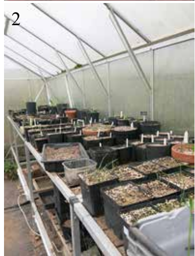
Fig. 1: Andrew Bannister Fig. 2: Andrew's greenhouse for winter-green species.