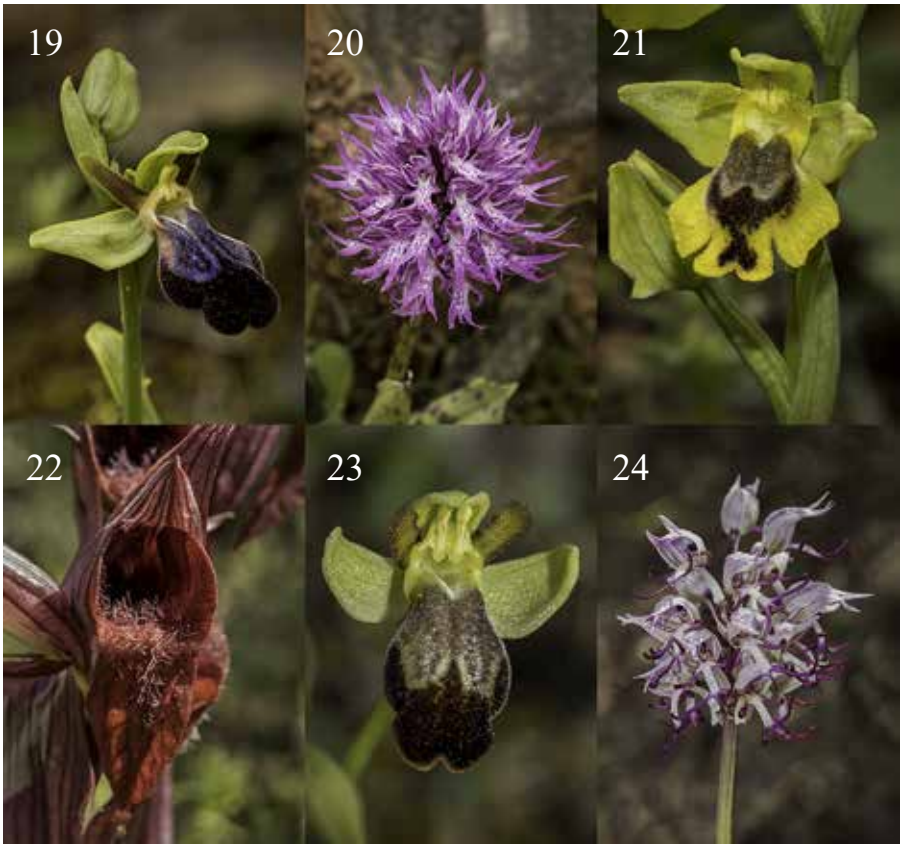
Fig. 19: Ophrys iricolor Fig. 20: Orchis italica Fig. 21: Ophrys sicula Fig. 22: Serapias carica Fig. 23: Ophrys pelinaea Fig. 24: Orchis simia

The work in the olive groves and manicuring of the ground has made the orchid hunters' task much harder but it is still worth the effort provided you do your homework before your visit. There was a marked lack of reptiles, presumably a result of the later season and lower temperatures. We regularly came across tortoises in the olive groves and that was a treat. Lesvos is largely unspoilt by tourism. There are plenty of ancient sites to visit including a large castle at Mytilini, two aqueducts, a petrified forest (not open to the public before Easter but there were petrified trees at the roadside in that area) and hot springs.