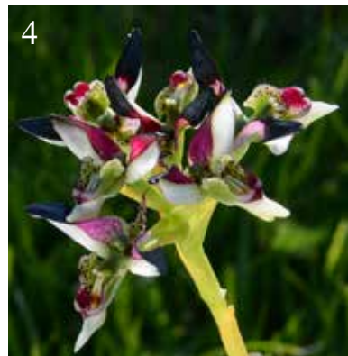
Fig. 3: Disa lugens Corrin Fig. 4: Disa atricapilla