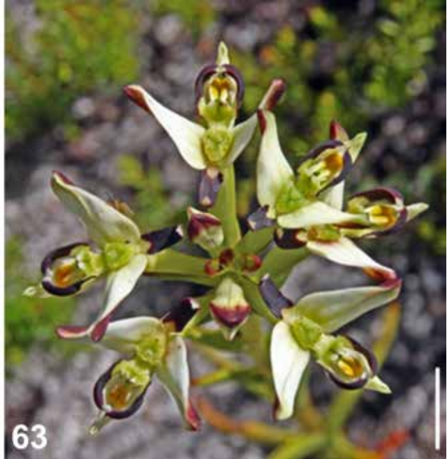
Figures. 62-63. Disa bivalvata .

Pollination is mainly by male digger wasps, Hemipepsis hilaris in the case of D. bivalvata and Podalonia canescens for D. atricapilla . Both are wasps that drag stunned prey to sandy burrows on which to lay their eggs, spiders in the case of Hemipepsis and caterpillars in the case of Podalonia .