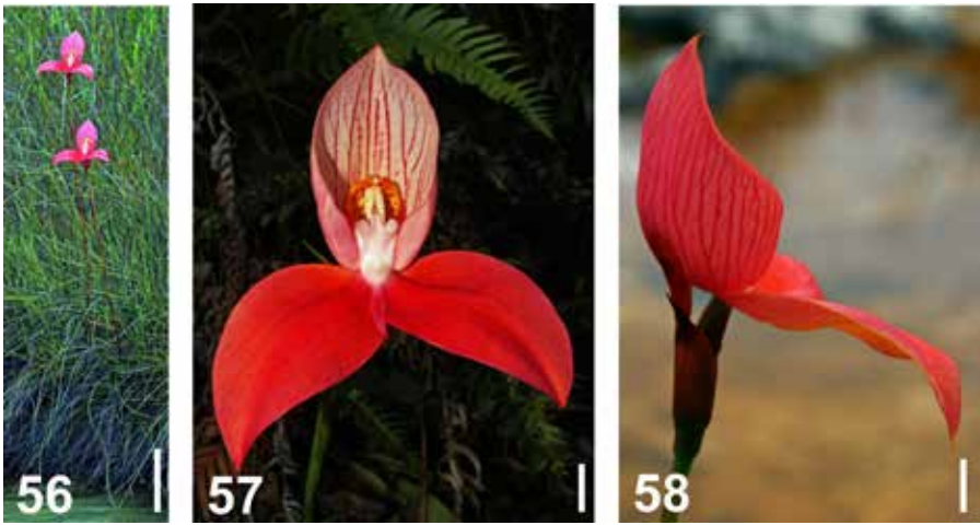
Figs. 56-58. Disa uniflora

Just as D. uniflora is informally known as the Red Disa, Disa graminifolia is the Blue Disa. It was originally assigned to the genus Herschelia , which has been incorporated into Disa in recent years.