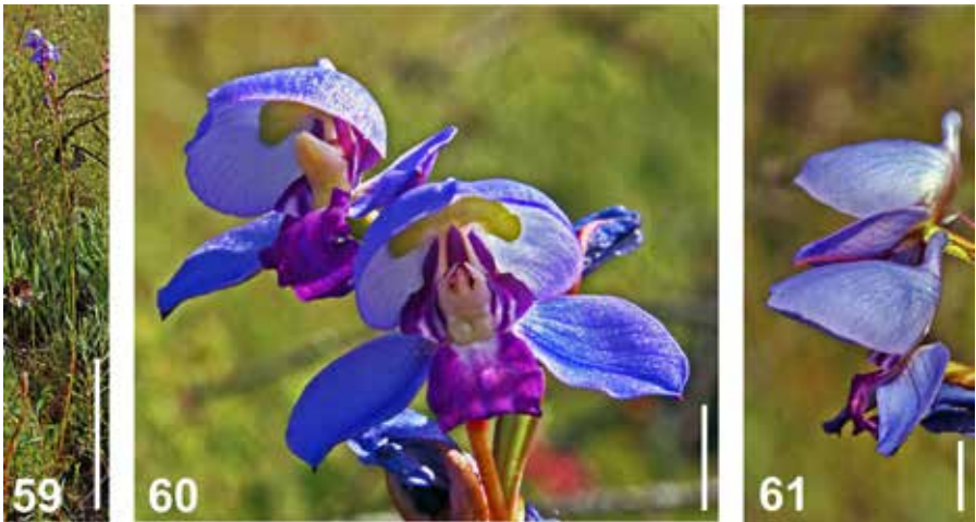
Figures 59-61. Disa graminifolia

Just as D. uniflora is informally known as the Red Disa, Disa graminifolia is the Blue Disa. It was originally assigned to the genus Herschelia , which has been incorporated into Disa in recent years.