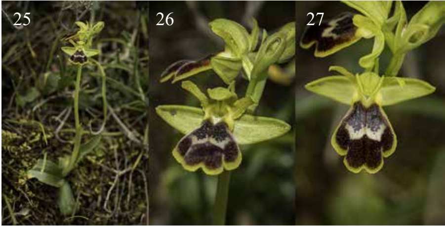
Fig. 25-27: Three images of a plant near Loutra that divided opinion on identification. Suggestions included Ophrys lindia , Ophrys cesmeensis , Ophrys bilunulata ssp. punctulata and O. pelinaea .

One of the challenges we faced was the identification of some of the Ophrys . The three images in Figures 25-27 show a plant we found on the walk near Loutra. As we were unsure what to call it the images were sent to a number of people for their opinions. Each one came back with a different name – Ophrys lindia , Ophrys cesmeensis , Ophrys bilunulata ssp. punctulata , and then one revised ID of O. pelinaea .