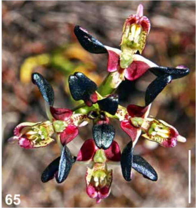
Figures. 64-65. Disa atricapilla