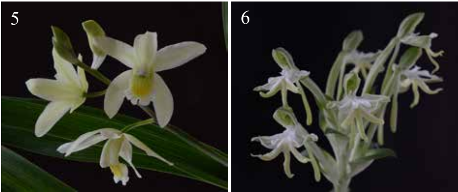
Fig. 5: Bletilla ochracea Gold