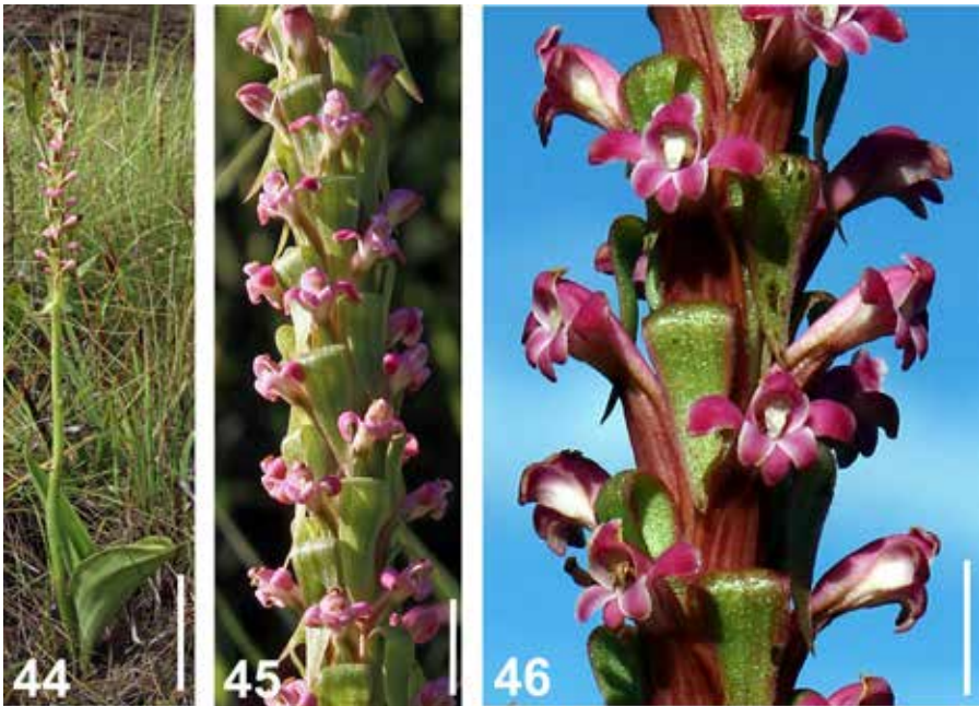
Figures 44-46: Satyrium neglectum . Scales for whole plant 10cm, for close-ups 1cm (scales similar for all other illustrations).

Part 2 of this article deals with two of the most important genera in South Africa, Satyrium and Disa . Together they amount to around 40% of the South African orchid flora. The genus Satyrium is distinguished by non-resupinate flowers having twin spurs on the labellum (hence the generic name), although they are usually obscured by the density of the inflorescence and bracts (but see Fig. 53). The lip forms a hood over the column, whilst the median sepal and lateral petals, sometimes reduced, are arranged in a fan at the base of the flower. It is a genus largely confined to Africa with 41 species in South Africa. Several species have off-set leaves as in S. neglectum , which has a scattered distribution from the Eastern Cape up to northern South Africa. This species can grow up to 80cm tall with small pinkish to red flowers scattered up the narrow spike. Satyrium carneum is not uncommon in coastal environments on the Western Cape and S. corifolium has a similar, slightly more extensive, distribution. Both have leaves more or less flat lying at the base of the stem. These three species give a good indication of the range of flower shapes among species of this genus.