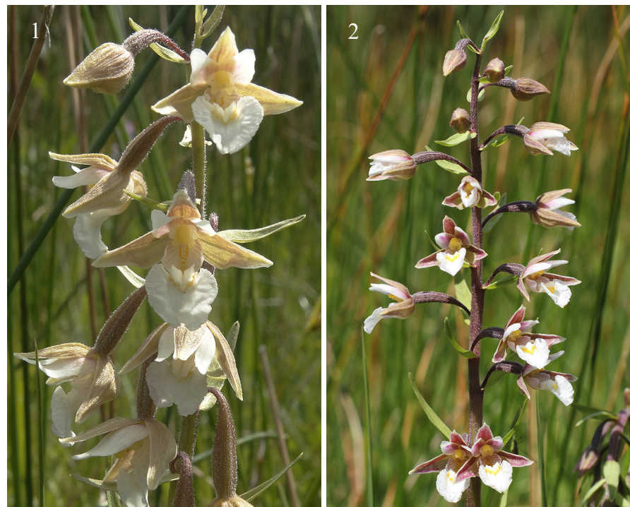
Figs. 1 & 2: North Somerset, showing how plants at a site can vary in colour.

Epipactis palustris , Marsh Helleborine, is one of our more widespread Epipactis ; the BSBI distribution maps show records from 517 hectads across the UK. It is also one of the more colourful species. The normal form has a brownish purple ovary, greenish-yellow sepals flecked with purple on the outer surface and more solid purple on the inner surface, white petals flushed pinkish purple at the base and a white hypochile with bright purple veining on the inside. These colours can vary considerably, both between and within colonies (see Figures 1 and 2).