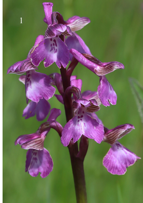
Figs. 1 & 2: Anacamptis morio at Martins’ Meadows Figs. 3 & 4: Orchis mascula at Martins’ Meadows