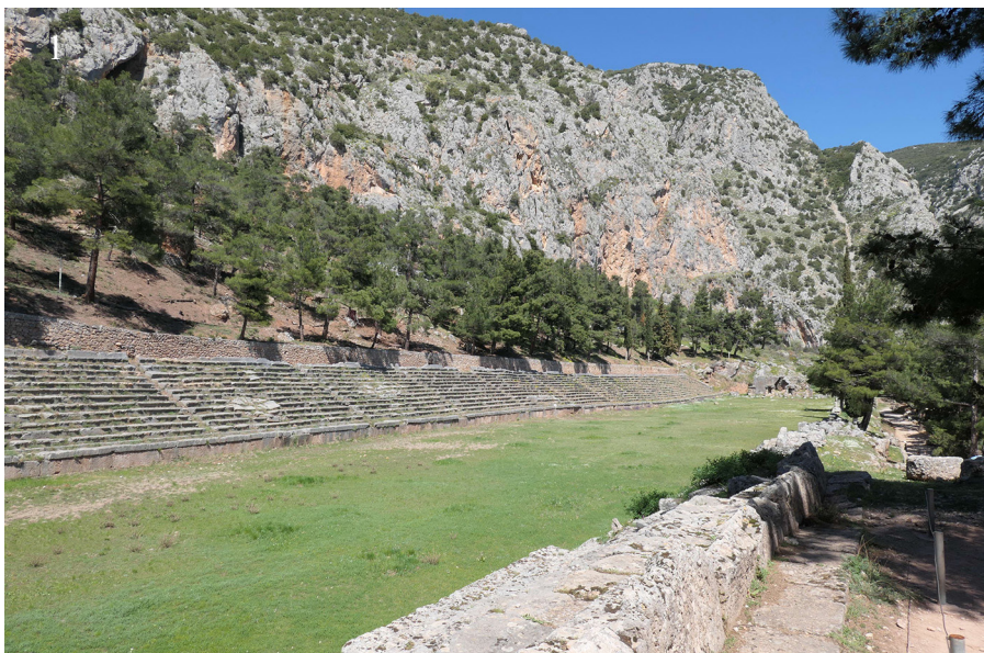
Fig. 1: The stadium at Delphi.

Enchanted by these words, I could hardly wait to visit Greece when I was first invited to lecture on plants on a Swan Hellenic cruise in April 1979. I visited many sites over the fortnight both in Greece and in Aegean Turkey and I was not disappointed. Scrambling around on the slopes above the stadium at Delphi, for example, I saw some ten species of orchid, including the enigmatic Ophrys \times delphinensis . Over the