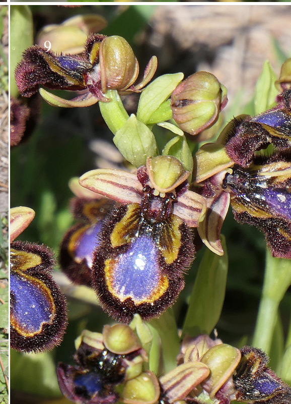
Fig. 6: Horseshoe Orchid ( Ophrys ferrum-equinum ). Fig. 7: Dingy Bee-orchid ( O. fusca subsp. cinereophila ). Figs. 8 & 9: Mirror of Venus Orchid ( Ophrys speculum ).