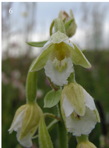
Fig. 6: South Wales, f. ochroleuca , an example with the purple veining inside the hypochile

More recently, although both Lang (2004) and Foley and Clarke (2005) say it lacks the red-brown colours, the photographs in both show purple veining on the inside of the hypochile. Jenkinson (1995), Ettliger (1997) and Harrap (2005) all specifically mention the purple veining being retained.