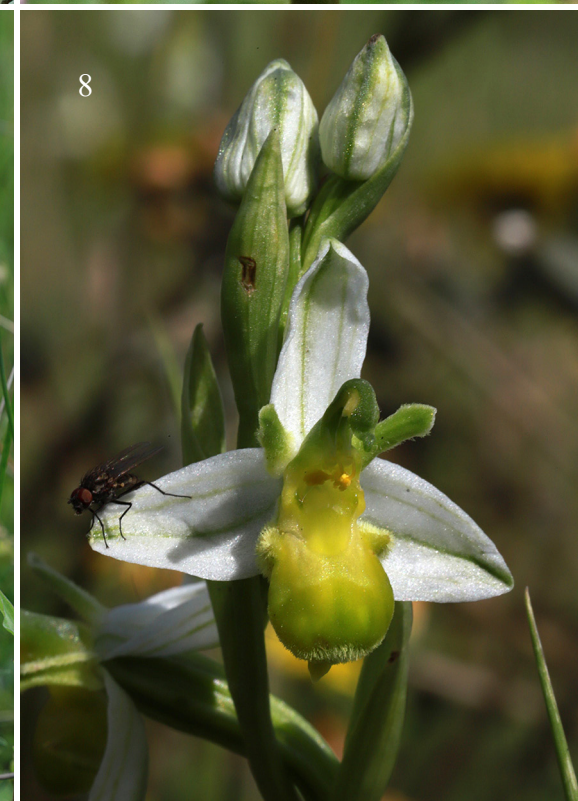
Figs. 5 & 6: Orchis militaris at the Rex Graham Reserve. Fig. 7: Gymnadenia densiflora at Market Weston Fen. Fig. 8: Ophrys apifera close to Sizewell Nuclear Power Station.