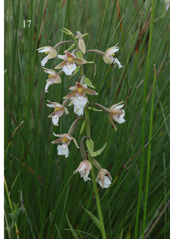
Figs. 17: Epipactis palustris at Market Weston Fen. Fig. 18: Epipactis helleborine at Santon Downham. Figs. 19 & 20: Epipactis purpurata at Grunton Wood.

Another August flowerer is one of England's rarest orchids Goodyera repens . The large Holkham Estate, owned by the Earl of Leicester, in north Norfolk, extends to the sea and is an unlikely site for the species as the others are in Cumbria, Northumberland and County Durham. The estate manages the Holkham National Nature Reserve which in summer is a popular attraction with miles of sandy beaches, confirmed by the full car park at 11 am on a weekday. In the nineteenth century the third Earl planted a belt of Scots Pines on the dunes to protect his re-claimed land, former salt marsh, from the wind blown sand. It is here on the seaward edge the orchid is located hidden amongst the trees in a thin mossy layer over the pine needles. The origin of the two small colonies is unclear, seed may have arrived on the roots when the trees were first planted or found its way naturally. Interestingly, the species was also discovered at other places nearby, including heathland in the 1880s to 1900s long before the Holkham plants were found in the 1950s. It was first described by Linnaeus as Satyrium repens in 1753 and the type specimen, now housed at the Linnean Society, London was originally purchased by Norfolk born James Smith the society's founder and first President.