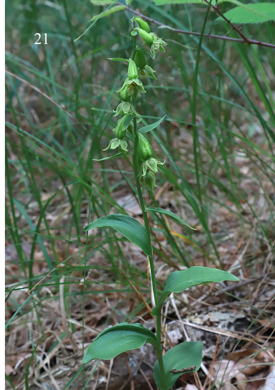
Fig. 21 Epipactis phyllanthes at Santon Downham. Figs. 22 & 23: Goodyera repens at Holkham. Fig. 24: Spiranthes spiralis at Tydd Gote.